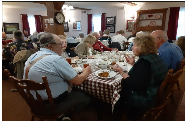
Amana Spring Banquet