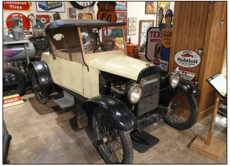
Anamosa Motorcycle Museum