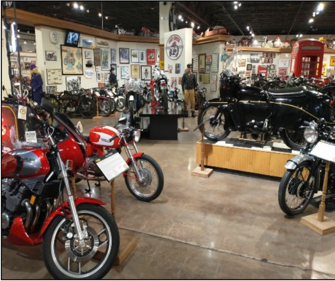
Anamosa Motorcycle Museum