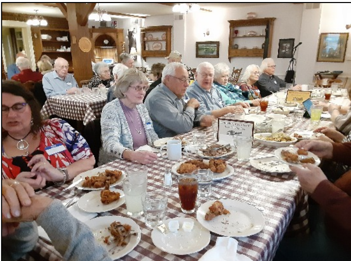
Amana Spring Banquet