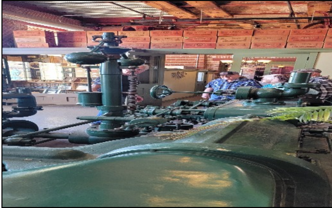
Star Brewery-Dubuque, Ia