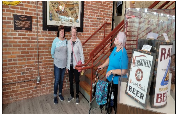
Potosi Brewery Museum-Potosi, Wi