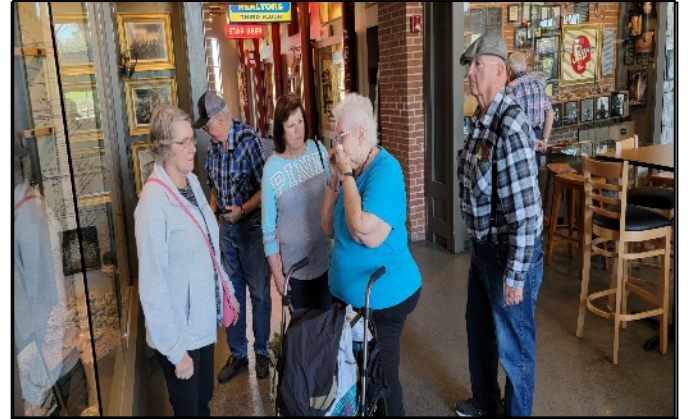
Star Brewery-Dubuque, Ia