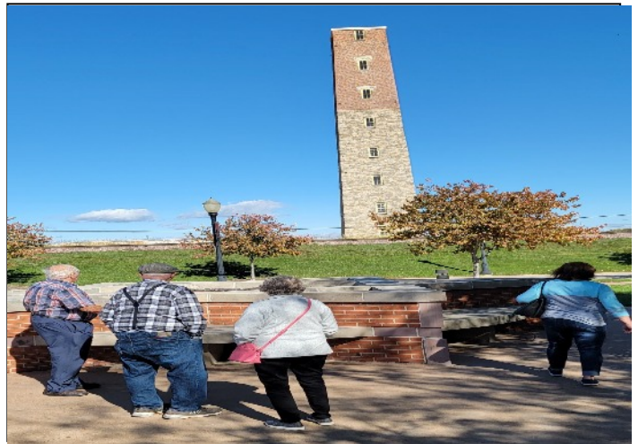
Shot Tower-Dubuque, Ia