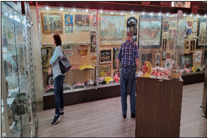
Potosi Brewery Museum-Potosi, Wi