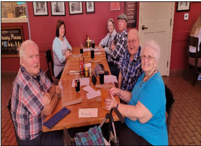
Lunch Potosi Brewery Museum-Potosi, Wi