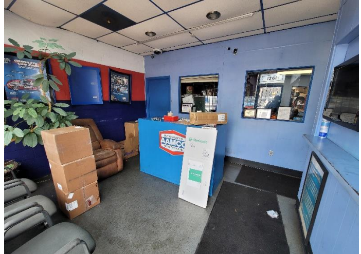
1261 Getwell Rd, Memphis, TN 38111