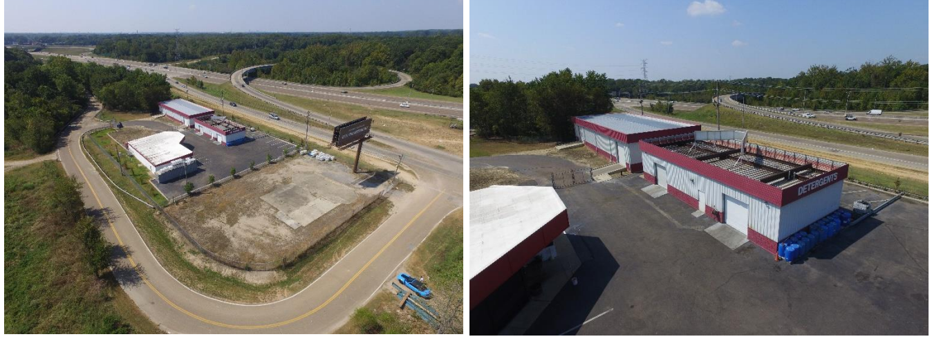
2732 Old Austin Peay Hwy, Memphis, TN 38128