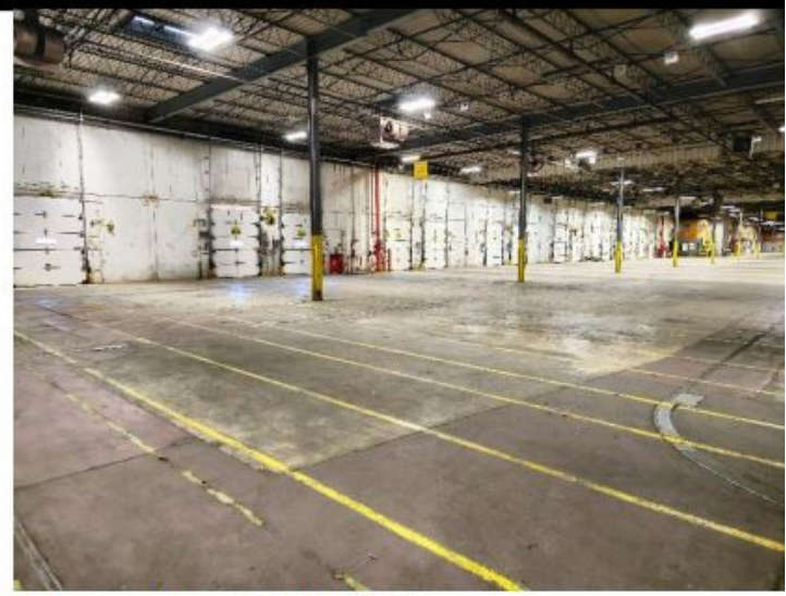
4300 New Getwell Rd, Memphis, TN 38118