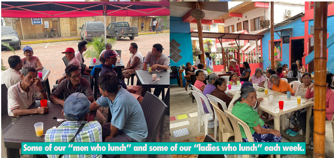
Some of our "men who lunch" and some of our "ladies who lunch" each week.

Join us on our Senior Lunch Facebook Page .