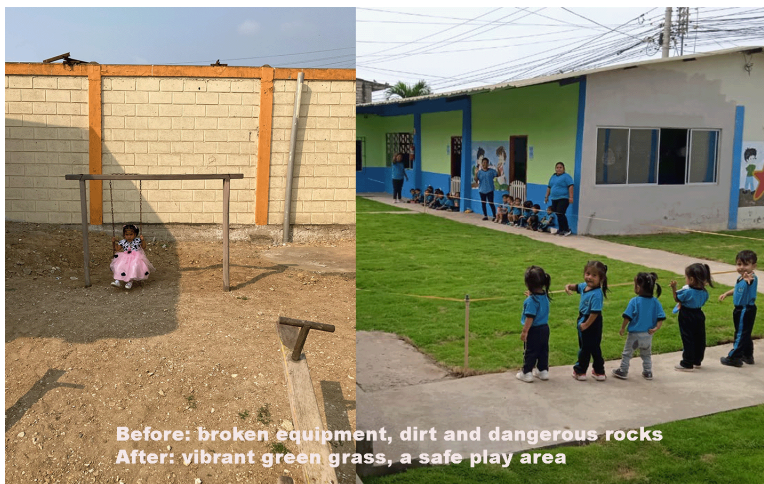
Before: broken equipment, dirt and dangerous rocks After: vibrant green grass, a safe play area