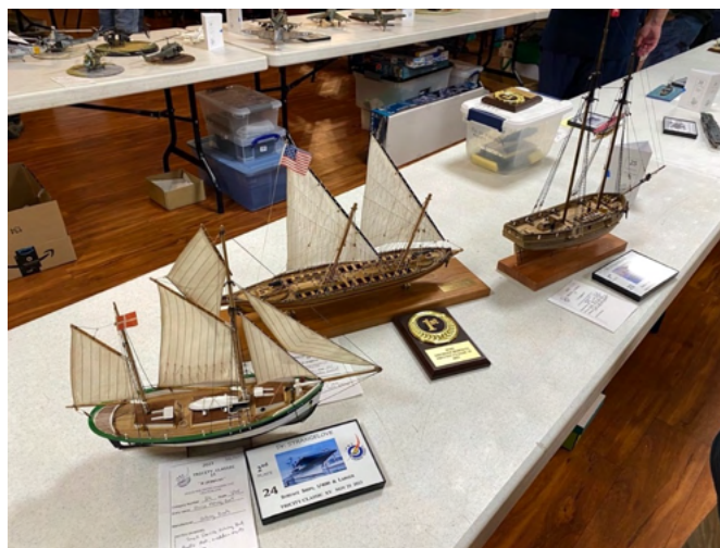
Fig. 5. Models entered by SBMS members in the recent 2023 IPMS Tri-City Classic model convention in Fremont. Left to Right: Fishing cutter, Dana , American Gunboat, Arrow , HM Schooner, Pickle . Close up photos of these models in the November Foghorn . (Jacob Cohn)