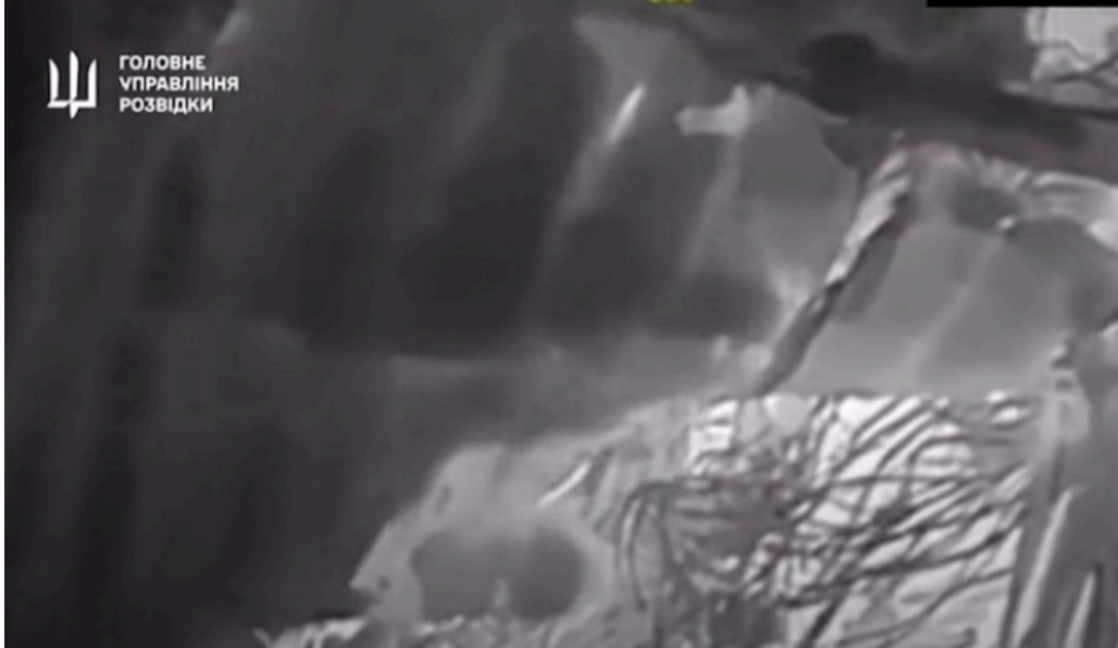
Fig. 9. View into the burning hole punched into side of Caesar Kunikov .

To date, the Ukraine military, through the press, has claimed disabling up to 25 Russian ships and one submarine amounting to one third of the Black Sea Fleet. Most of these operations used what they call the “MAGURA” V5 drones (Fig. 10) packed with 500 pounds of explosives and powered by jet ski engines. More on Ukrainian sea-drones in the December 2022 Foghorn .