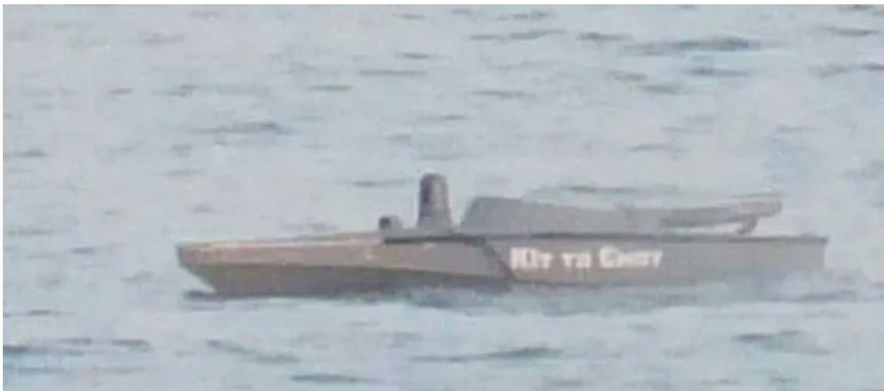
Fig. 10. Ukrainian Magura V5 armed drone, (Ukrainian Defense Forces)

To date, the Ukraine military, through the press, has claimed disabling up to 25 Russian ships and one submarine amounting to one third of the Black Sea Fleet. Most of these operations used what they call the “MAGURA” V5 drones (Fig. 10) packed with 500 pounds of explosives and powered by jet ski engines. More on Ukrainian sea-drones in the December 2022 Foghorn .