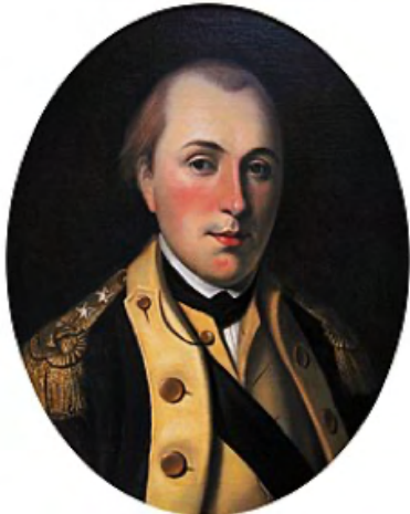
Fig. 4. Gilbert du Motier, Marquis de Lafayette (1757-1834)

During the American Revolution, Lafayette was a French aristocrat who became convinced that it was a noble cause and lobbied the French government for aid to the Americans. Not hard as the French had mostly been adversaries of the English for centuries before. He also commanded Continental Army troops during the Siege of Yorktown in 1781 which led to the defeat of British troops under General Cornwallis during that last battle of the war.