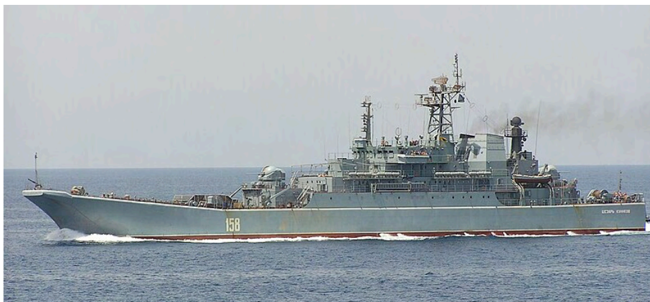
Fig. 6. Russian landing ship, Caesar Kunikov as seen in 2003. (Luis Díaz-Bedia Astor) The bow has two doors in the front that can open to disgorge cargo.

More recently, on February 14, 2024, near the second anniversary of the sinking of the Moskva , the Russian landing ship, Caesar Kunikov (Fig. 6), was attacked and heavily damaged by sea-drones punching holes into the port side of the ship leading to its sinking. Remote video taken of the attack from a drone has been released to the press showing explosions on the Kunikov (Fig. 7, 8, 9).