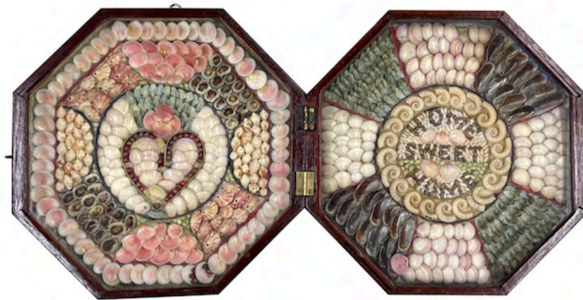
Fig.1. 19 th Century folk art item often referred to as a “Sailor’s Valentine” from the collection of the South Street Seaport Museum , New York City. ( South Street Seaport Museum )