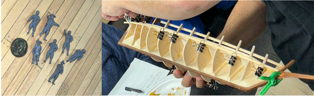
Fig. 15. Left, 1/64 scale figures made by Clare Hess on a 3 D printer. These new machines show remarkably small detail! Right-planking the hull of the ship kit Mystique by Corel. The planking his held in place by paper clips while being applied, The Mystique was an unusual ship built on a xebec hull, with square rigged main and mizzen masts and a lateen sail on the foremast.