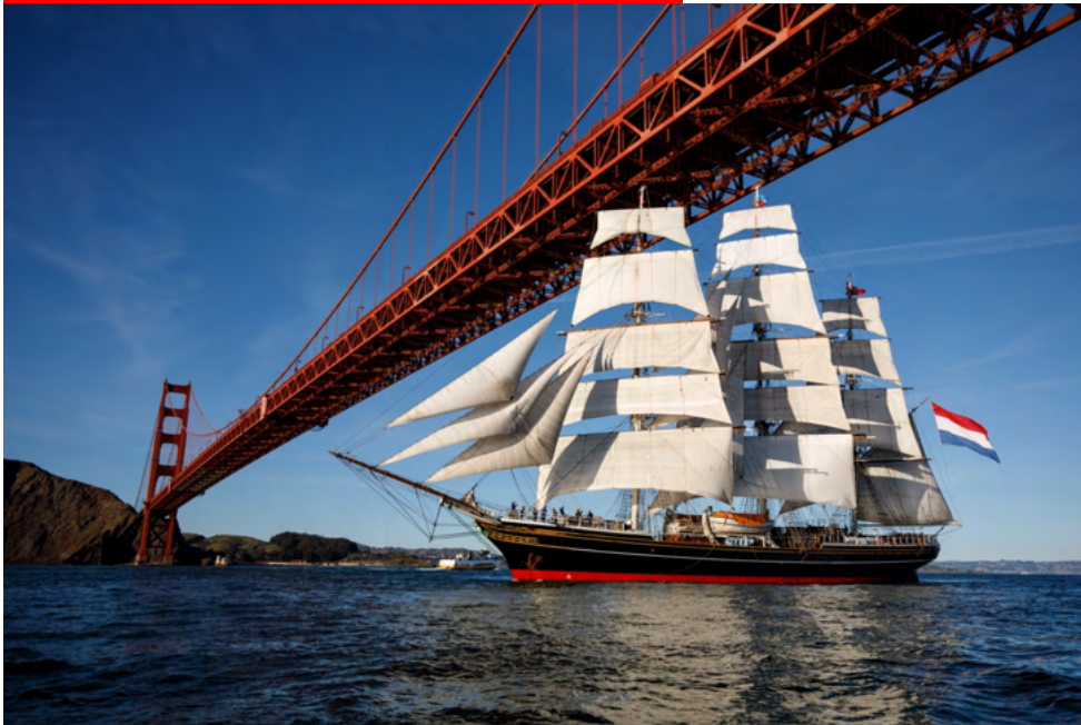
Fig. 2. Dutch tall ship, Stad Amsterdam passing under Golden Gate Bridge. This ship is scheduled to arrive under the Golden Gate Bridge Wednesday, March 6 sometime in the afternoon. ( Stad Amsterdam )