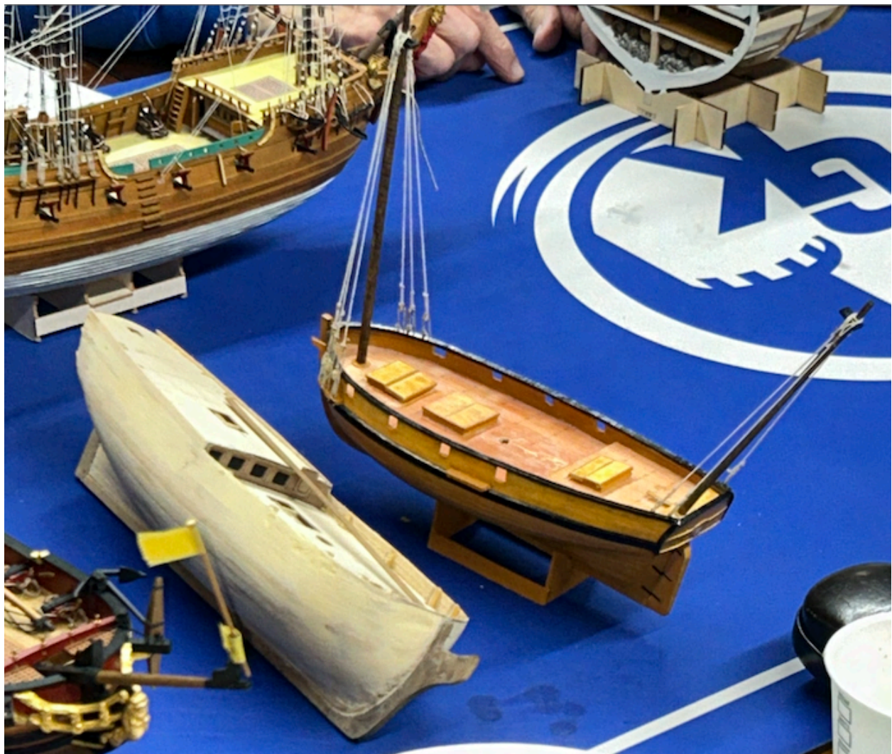
Fig. 11. Two boats in progress by Jacob Cohn. The unpainted hull on the left is that of Vanguard models's HMS Speedy . The model on the right is a card model from Shipyard of Le Coureur .