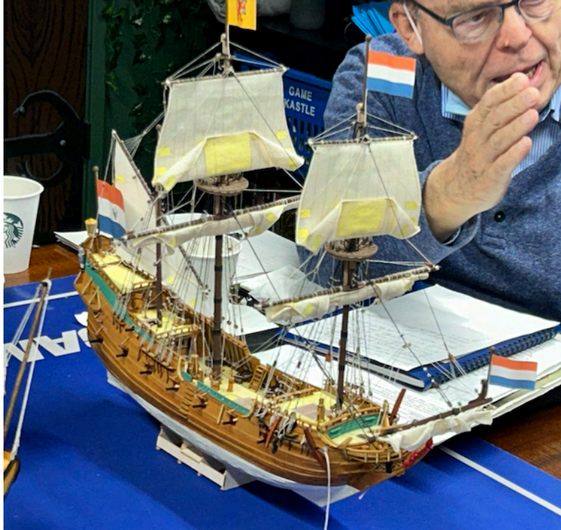
Fig. 12. Almost finished! The Papegojan from Shipyard models built by George Sloup (on the right).