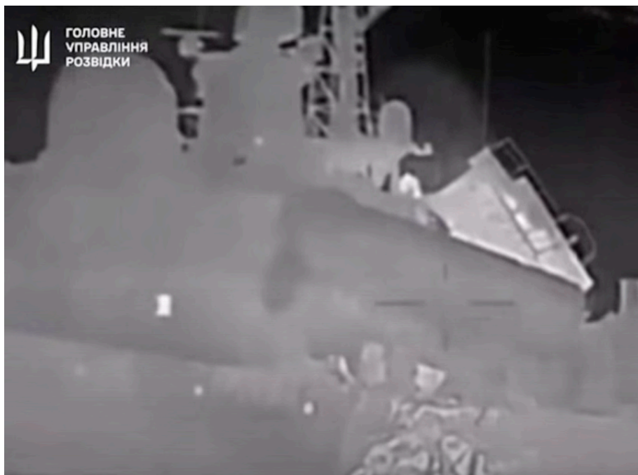
Fig. 8. Fiery hole blown into port side of Caesar Kunikov below the superstructure.