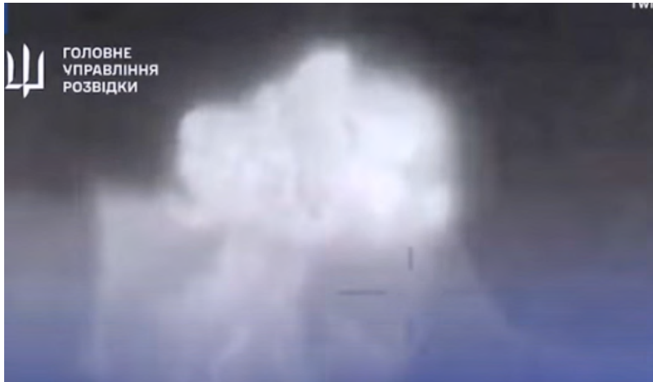
Fig. 7. Mushroom cloud from sea-drone impacting Caesar Kunikov .