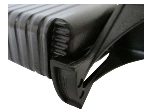
Close up of the ratchet clips