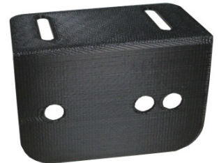
274-DLS306-U sold separately