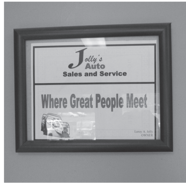
Several positive signs are located in the reception area at Jolly's Auto Sales and Service.

The hours of operation are Monday through Friday from 8 a.m. to 5 p.m. The phone number is (434) 848-4586 and the number for 24-hour towing is (434) 532-5237. The address is 223 Poor House Road, Lawrenceville.