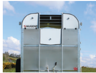
Sectional fold down front panels.