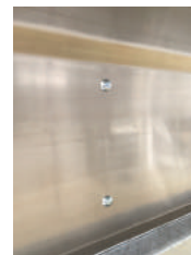
Mono bolts pin and collared joint fabrication.