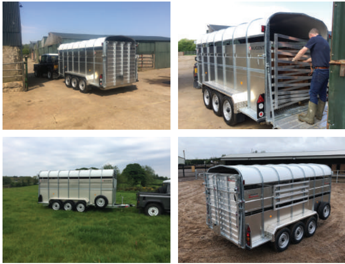
Tri axles are optional on 12 and 14 foot models and offer extra stability. Aluminium mudguards are standard on all tri-axle models.