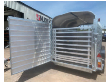
Single Door. Can also be used as a ramp.