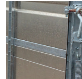
Closed in bottom vents.