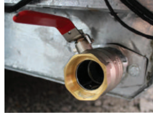
Collection tank lever valve allows for simple, safe and hygienic disposal.