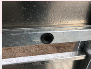
Gate retaining plunger.