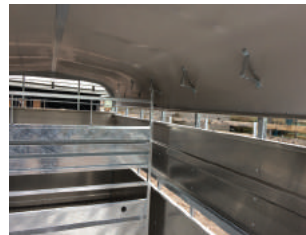
Multiple dividing gate hangers for tailored sectioning of each load.