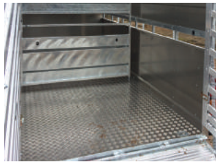
33mm timber floor with a one piece, fully sealed 3mm aluminium tread plate floor covering.