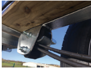
Dual Drive™ suspension.