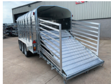
Fold-up sheep decks.