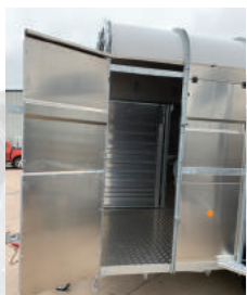
Open side door (not available with sheep decks).