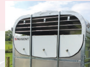
Nugent's unique trio of fold down front panels allow farmers to control the level of air flow through the trailer. This reduces drag to provide for a better towing trailer, while significantly decreasing fuel consumption.