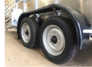
Wheels: bigger surface area tows better in fields and gives extra stability on the road. Less rolling resistance, giving a better fuel efficiency & reducing the pull on the towing vehicle.