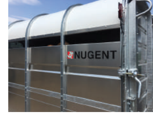
Folded sides for extra strength.