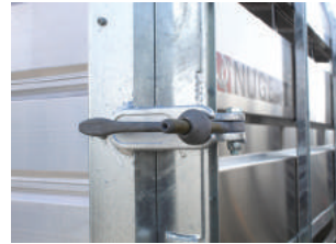
Robust taildoor fastener. Winders are simple but effective and help to strengthen the trailer when the ramp is closed.