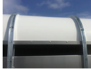
Aluminium spouting reinforces the roof.