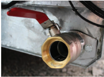
Collection tank— fully welded and sealed —hygienic disposal.