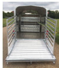
Reinforced loading ramp.