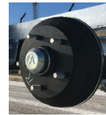
Market leading Knott brakes and axles.