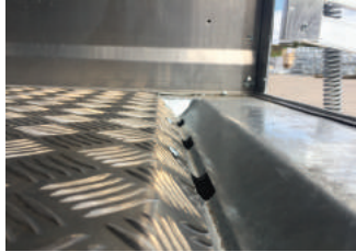
Metal collection tank designed for maximum efficiency.