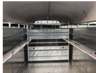
Internal dividing gate with multiple hanging locations (excluding the 8ft model).