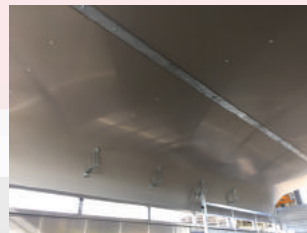
Tough central roof structure with edge retainer.