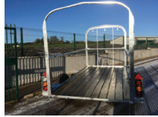
33mm preserved timber floor with aluminium treadplate for a fully sealed finish.