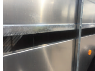
Incorporated box section for strength and reinforcement.