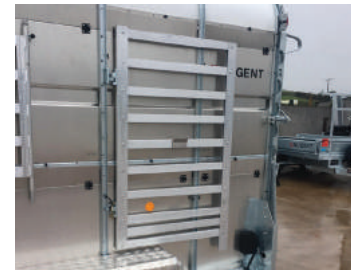
Additional pair of loading gates.