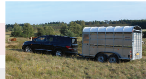
The Nugent 7 foot high option is suitable for transporting horses.