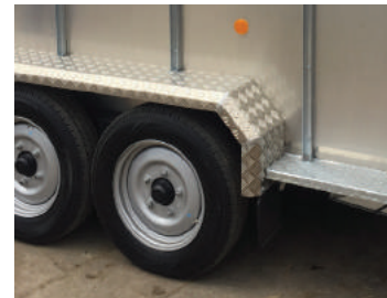
Aluminium mudguards for twin axle models.