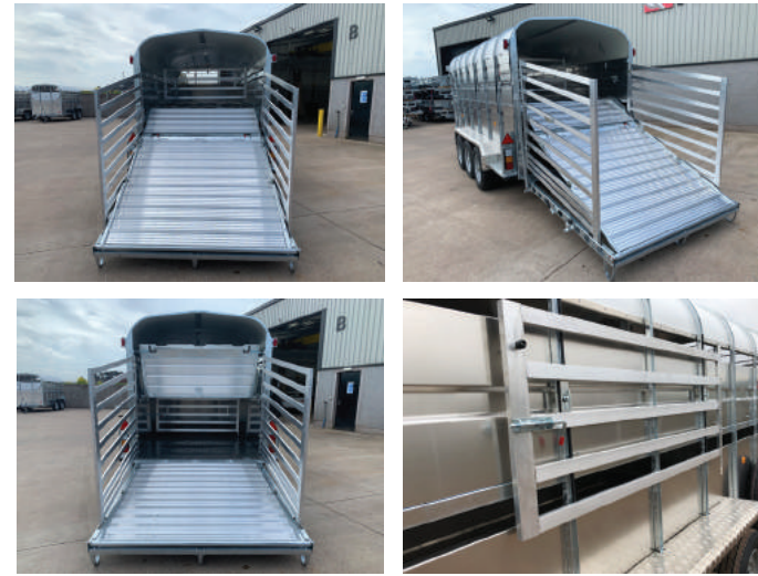
Fold-up sheep decks are conveniently and safely stowed for quick and easy access. They can be deployed without the need for any tools or special equipment. Dividing gates are supplied in both heights for when decks are in or out of use.