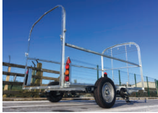
Chassis made from angle iron with a fully welded frame for maximum strength and endurance.