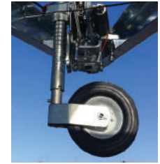
Heavy duty jockey wheel.