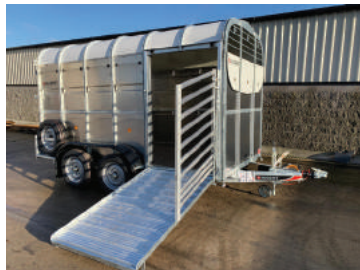
Front ramp door.