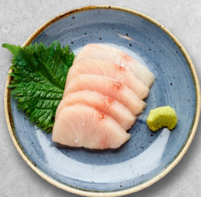
Hamachi (GF) 14.00