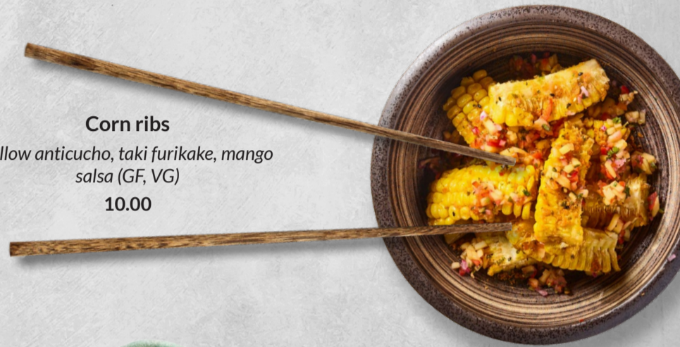
Corn ribs yellow anticucho, taki furikake, mango salsa (GF, VG) 10.00