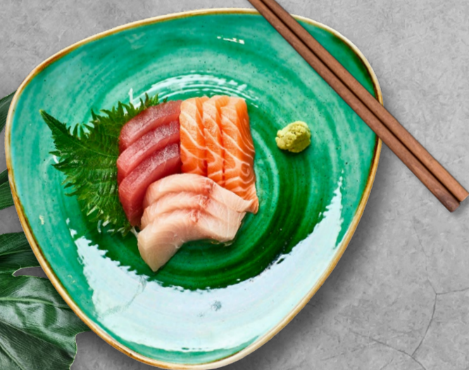
Mixed sashimi tuna, salmon, yellowtail (GF) (9pc) 22.00