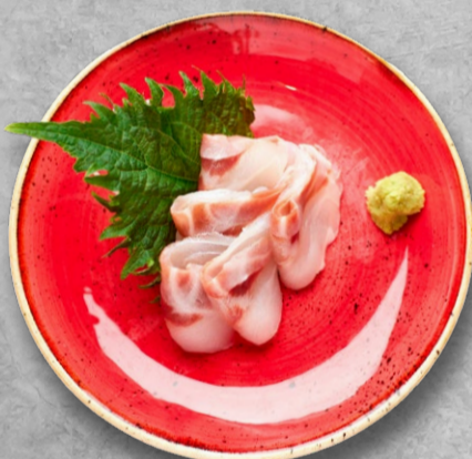
Sea bass (GF) 12.00