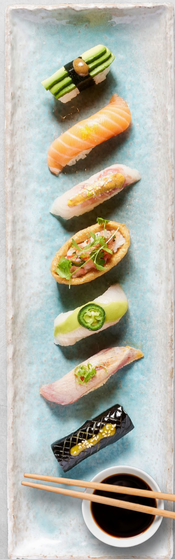
Nikkei nigiri platter assorted nigiri from the below (7pc) 36.00