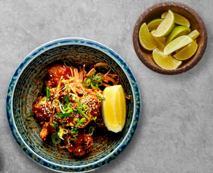
Nikkei chicken kara-age coated in chipotle mayo, red onion, sesame 11.00