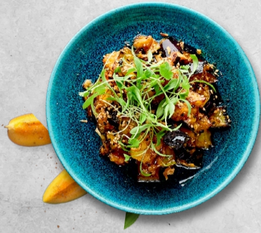
Nasu dengaku spanish & Japanese aubergine, mango miso, crispy shallots, sesame (GF, VG) 10.00