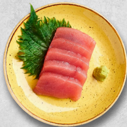
Bluefin tuna (GF) 16.00