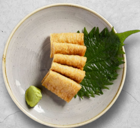
Vegan inari (VG) 9.00