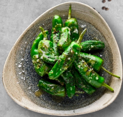
Padron peppers yuzu miso, Maldon salt (GF, VG) 9.00