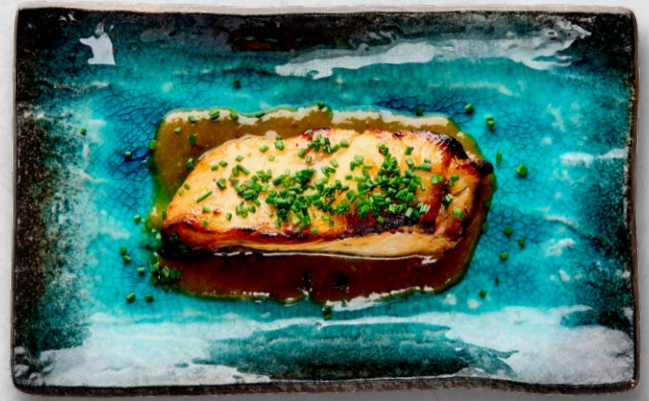
Black cod den miso yuzu, jalapeño, chives (GF) 36.00