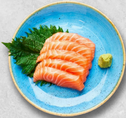
Salmon (GF) 12.00