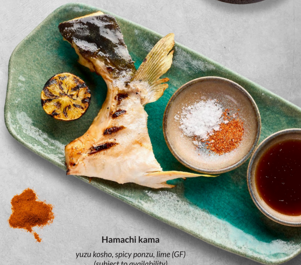
Hamachi kama yuzu kosho, spicy ponzu, lime (GF) (subject to availability) 26.00