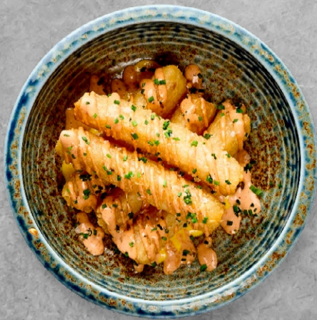
Casava wedges loaded with smoked panca sauce, huancaína cheese (GF, VG) 8.50