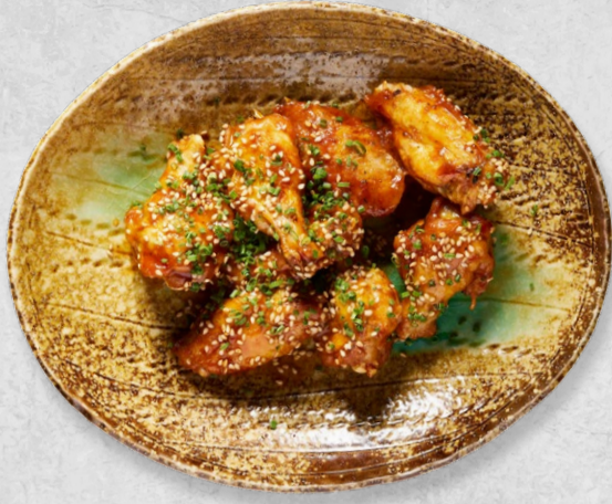
Anticucho wings red and yellow anticucho, sesame 10.00