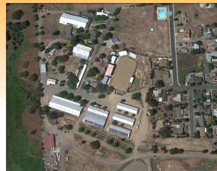
The Amador County Fairgrounds