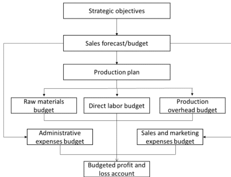
Figure 9.1 Budgeted profit and loss account elements

The projected budgeted balance sheet is calculated, taking into account any capital expenditure required on new investments, such as plant and equipment. The accounts receivable and accounts payable from sales and expenses are calculated, together with any changes in inventory levels to calculate the working capital and cash budget.