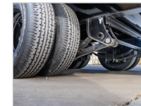
EXPANSIVE DUMP BOX

The reliable Heavy Duty Adjustable Suspension increases longevity and performance, is easier to maintain, and allows for adjustments when you need them.