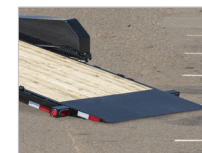
CARGO CONTROL STANDARD

Benefit from enhanced cargo securement with our standard full-length Rubrail and stake pockets. In addition to the built-in stake pockets, the Rubrail provides extra attachment points for securing your load. Customize your trailer further by adding optional D-rings.