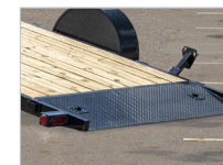
CARGO CONTROL STANDARD

Benefit from enhanced cargo securement with our standard stake pockets. Customize your trailer further by adding optional D-rings. (Standard flush-mounted D-ring shown)