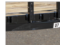
READY RAIL® - CUSTOMIZABLE & ADAPTABLE

Experience the advantage of additional factory-installed fastening solutions, such as D-Rings, Tie-Downs, and Stake Pockets, ensuring versatile and secure cargo management for all your transport needs.