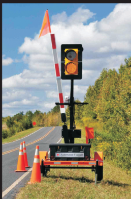
Single Trailer Operation