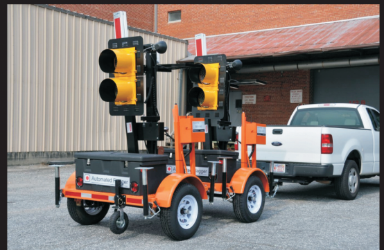
Two Trailer System

HIGHWAYFLAGGERS.COM, PORTLAND, OREGON, U.S. A.