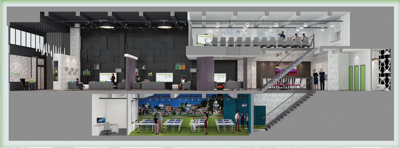
WEST TO EAST CROSS SECTION