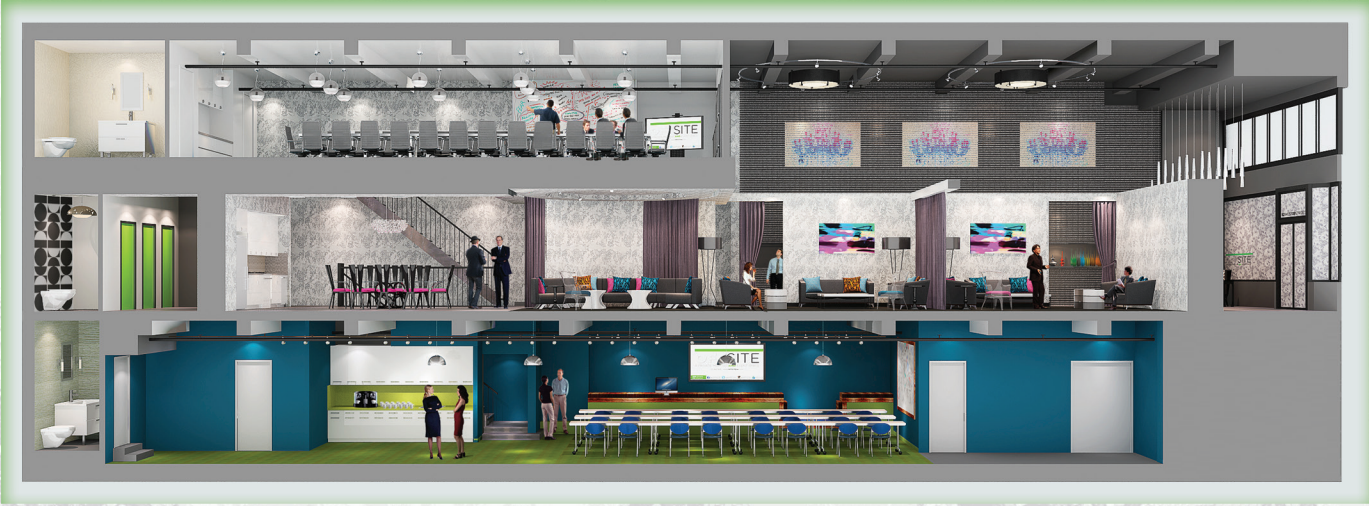
EAST TO WEST CROSS SECTION