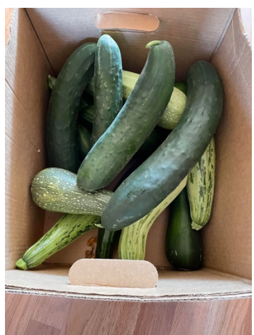
ready to pickle.

Sheila McCleary: My garden is doing great! Lots of cabbage, purple cauliflower, zucchini, yellow squash, kale, strawberries and chard. My eggplant is trying; there's a small one so far. Already gathered the rhubarb. I can see broccoli and brussels sprouts starting. Potatoes and even sweet potatoes have good foliage - will be interesting to see how they are doing underground later. Some small peppers, but oddly, they