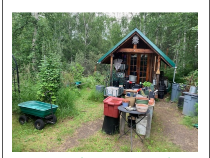
Dennis Rodger's garden