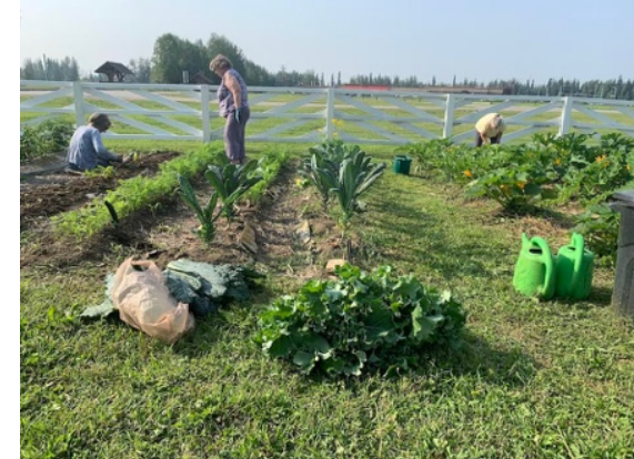
July 9, 2023 Harvestning at Creamer's Garden