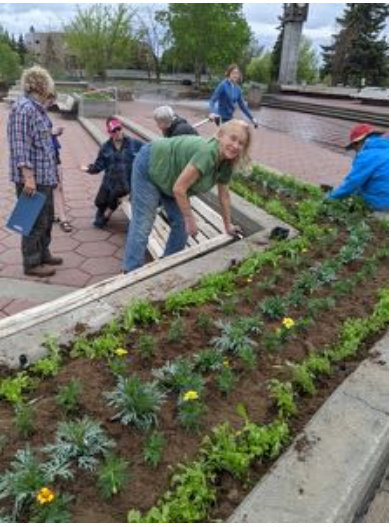
with Festival Fairbanks May 30, 2023