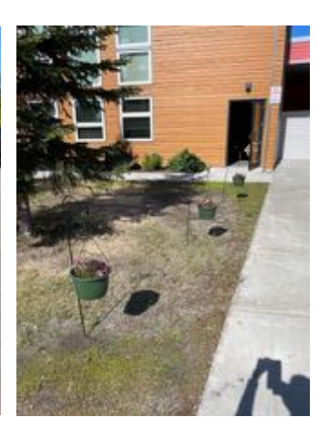
More Children's Museum pictures: