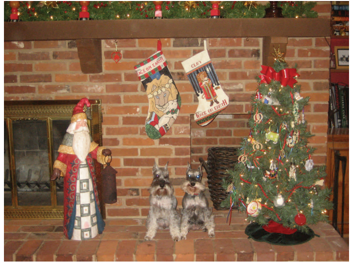
Indy & Abby 2020