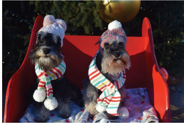
True & Violet