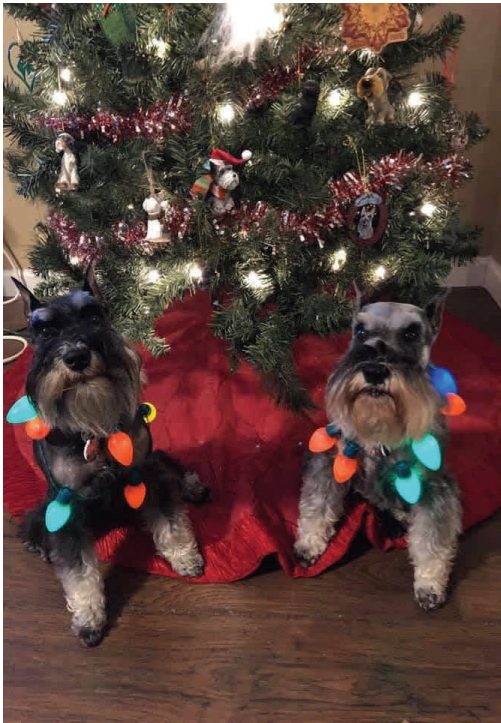
True & Violet