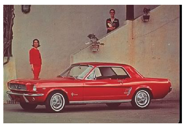
In 1966, likely at the same time that this MOLD figure was being vended, a 1966 Mustang Convertible was the first (and perhaps only) car to park on the 86th floor observation deck of the EMPIRE STATE BUILDING! Ford