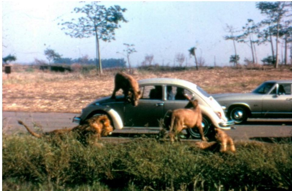
1974 Lion Country Safari, Laguna Hills, CA

The machine on the right is vending the large lion (the one on the left is vending the large elephant.) The Lion Country Safari wasn't founded until 1967, so it's not the original use of the small lion moldset. While over the years there were a number of locations for Lion Country Safaris, only one Lion Country Safari remains in operation, in Loxahatchee, Florida. Unfortunately for current collectors, that one Lion Country Safari no longer has a Mold-A-Rama machine (but they should!!)