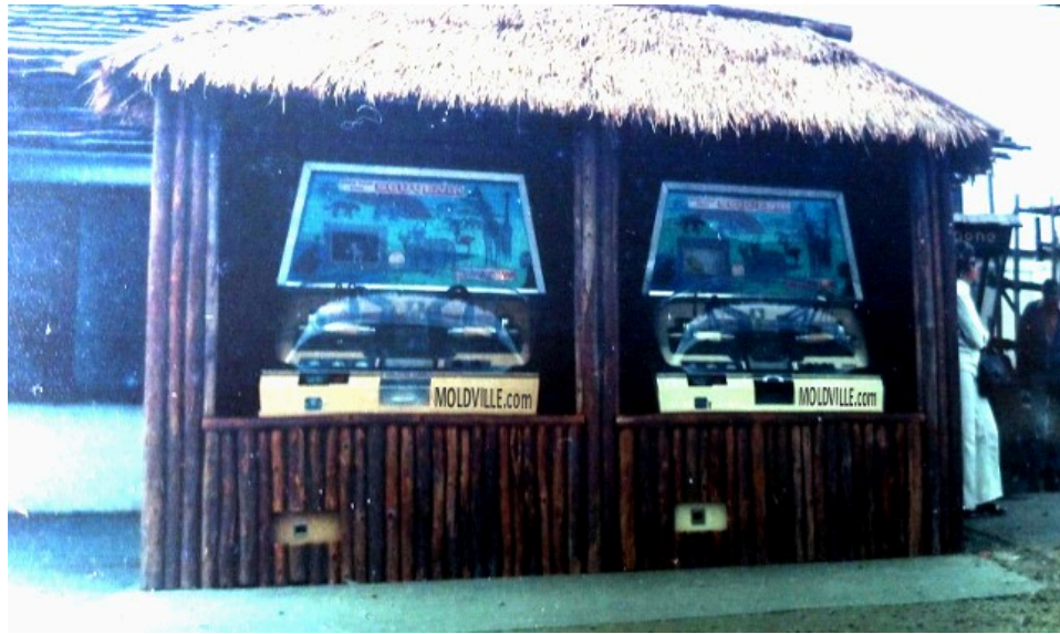
c1970s Lion Country Safari, CA

The machine on the right is vending the large lion (the one on the left is vending the large elephant.) The Lion Country Safari wasn't founded until 1967, so it's not the original use of the small lion moldset. While over the years there were a number of locations for Lion Country Safaris, only one Lion Country Safari remains in operation, in Loxahatchee, Florida. Unfortunately for current collectors, that one Lion Country Safari no longer has a Mold-A-Rama machine (but they should!!)