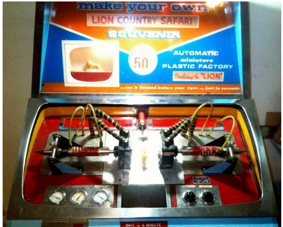
This is MOLDVILLE, 'dressed' with an original early 1970s plexi backglass from LION COUNTRY SAFARI, just for this week's production of lions!