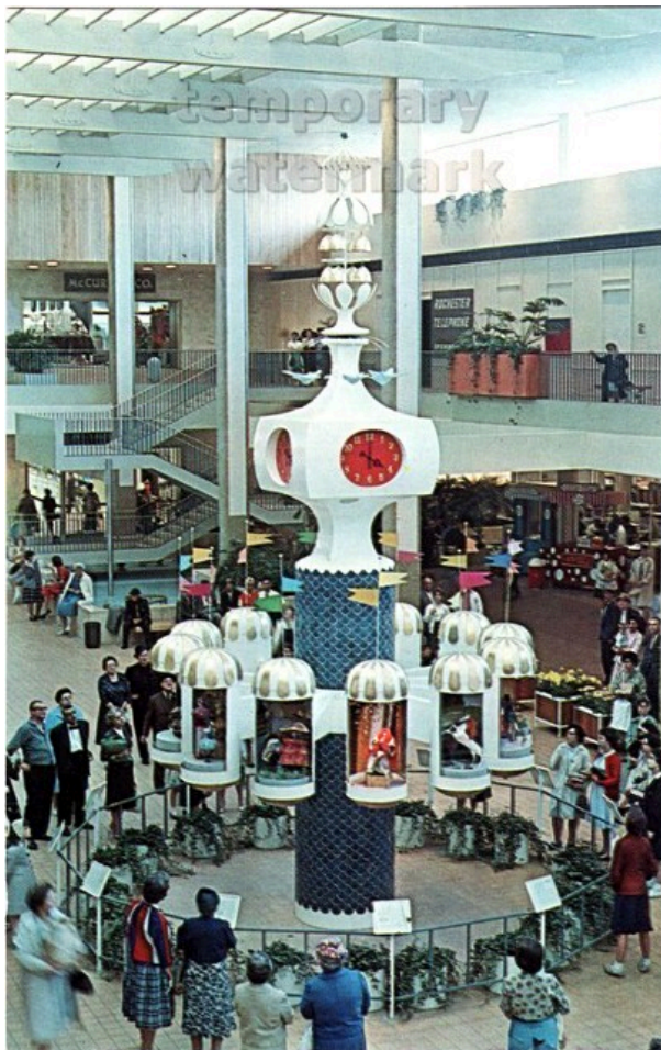
The CLOCK OF THE NATIONS was the centerpiece of the Midtown Plaza in Rochester, NY. The Midtown Plaza was a $30 million shopping center smack in the middle of Rochester, built in 1962 without any federal financial aid. It had a structured louvered ceiling, and was air conditioned, with a 2000 car garage, 50 shops, a half-dozen restaurants, and an 18-floor office building topped by a three-story, 78-room hotel. To get commercial traffic out of the way of customers, a delivery tunnel was built beneath the stores. In the spacious, columned malls and arcades it had gardens and sculptures. To add a town-square touch, it included sidewalk cafes, and planted trees with benches beneath them. The Midtown Plaza was glamorous, and patrons got "all gussied up to have lunch