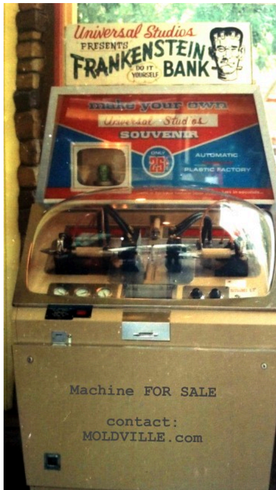
1960s UNIVERSAL STUDIOS, Los Angeles, CA