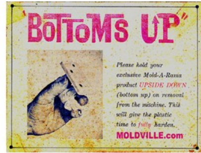
Also, here's a closeup of the only known surviving BOTTOMS UP card, just like the one seen on the lower right corner of the deck of the MOLD machine in the vintage photo from Universal Studios.