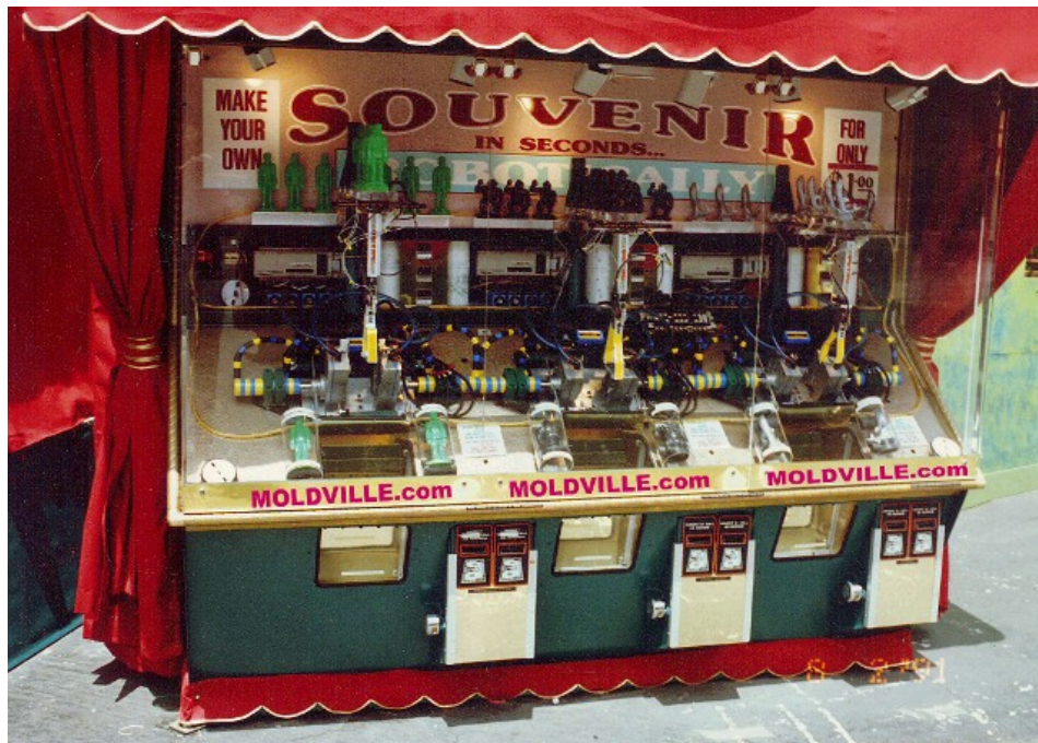
1990(circa) UNIVERSAL STUDIOS, Los Angeles, CA

The Frankenstein vended from this custom-made MOLD machine was the standing Frankenstein (not the Frankenstein Bank that is this week's figure) but I thought it would be fun to share this photo from Universal Studios anyway.