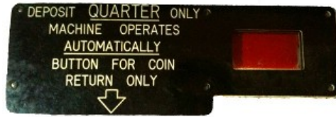
Here's a closeup of the coin entry plate seen in the vintage photo from Universal Studios.