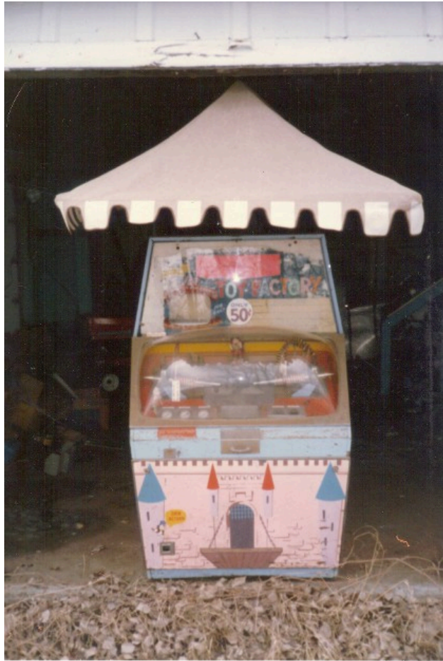
This is the garage where ELDIN IRWIN stored his mold machines in the early 1980s that were not on location. There were probably 15 more machines inside this garage.