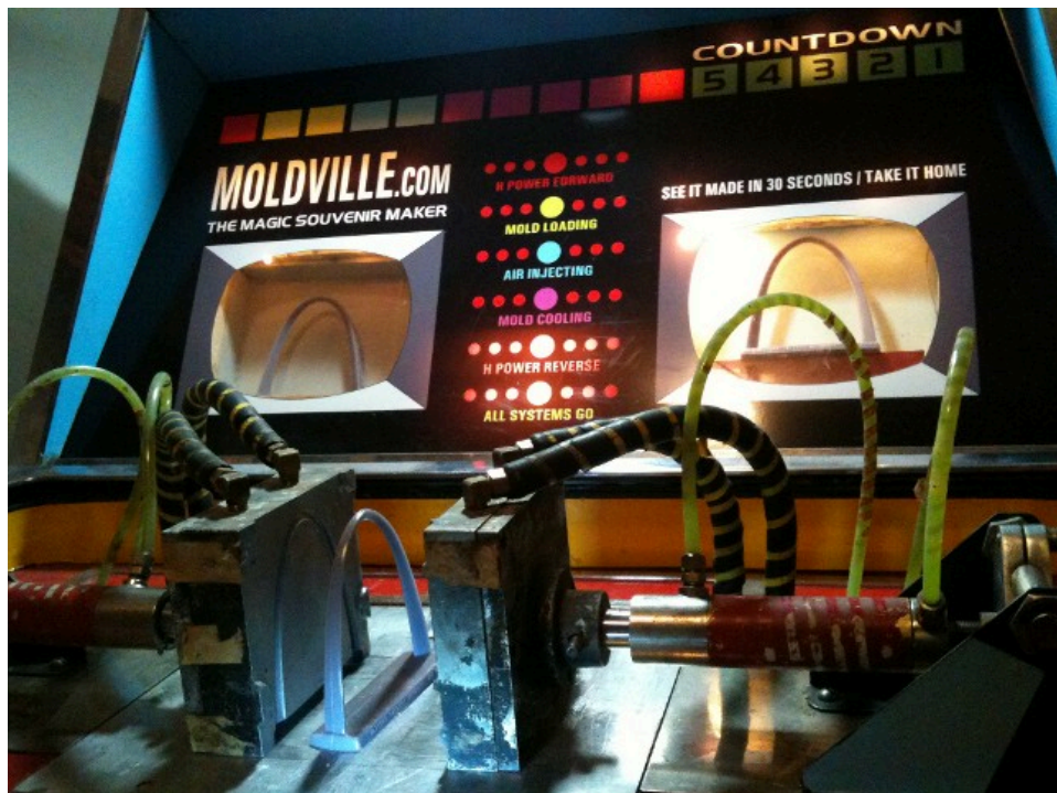
The original use of the GATEWAY ARCH is unknown, but it obviously was most likely used in St. Louis. The moldset itself is an unnumbered, late-style design, dating it post-1967.