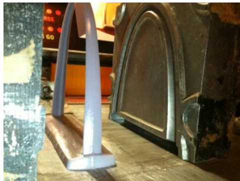
GATEWAY ARCH ST. LOUIS, MO. 630 FT.

The GATEWAY ARCH is one of my absolute favorite molds, particularly in its simplicity. It's also a rather sizeable mold. In fact, it's so long that it doesn't fit in the delivery bin when the shovel pushes it there. In operation, the operator must have instituted one of their tricks to spin the mold before delivery. One of these tricks was to use of a piece of duck tape placed on the vat cover in such a way that it would cause the mold to spin to one side as the shovel pushed it forward. Another trick might have been to use a trip wire toward the lip of the delivery bin.