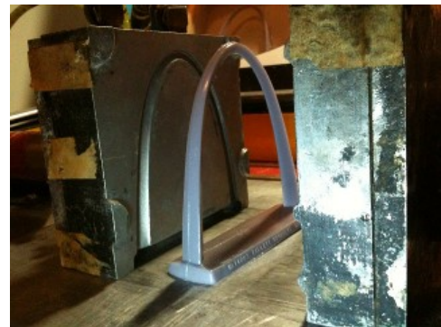
NATIONS TALLEST MONUMENT 630 FT.

Disclaimers: The color and/or exact condition of the MOLD you get in the CLUB-A-RAMA may or may not be as shown. Not for children under 3.