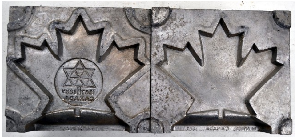
Front of base engraving: CENTENNIAL