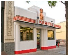
Uses of the KEWPIE DOLL have proliferated over the years, including as the mascot of Kewpie Hamburgers, founded in 1923 in Flint, Michigan (left), and since 1914 as the mascot of Hickman High School in Columbia, Missouri (right).