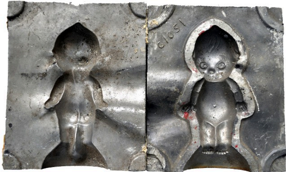
The numbering of the KEWPIE DOLL moldset puts it squarely in 1963.

Disclaimers: The color and/or exact condition of the MOLD you get in the CLUB-A-RAMA may or may not be as shown. Not for children under 3.