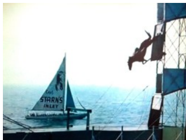
Does the sailboat passing in the background behind the DIVING HORSE on the Steel Pier in Atlantic City, NJ, (Reissued by MOLDVILLE in Week 14) look familiar?!