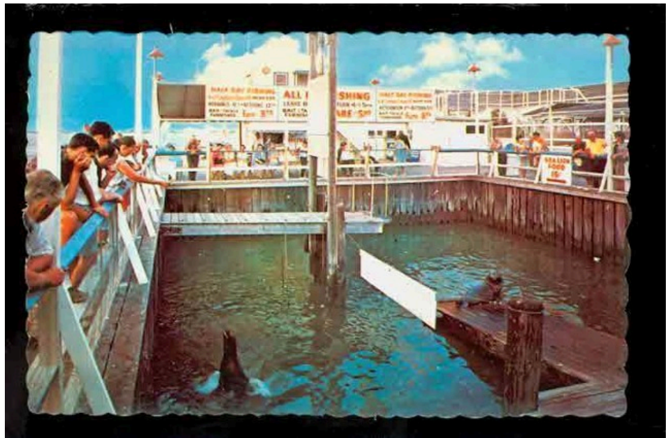
A popular pastime at Captain Starn's was to buy the seal chum for 15c and feed the seals and sea lions in the pen by the restaurant.