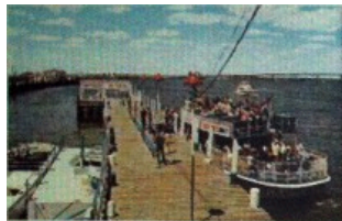
SUMMER AT CAPT. STARN'S PIER Always something to see and do...

A visit to Atlantic City is not complete without enjoyment of one of the famous sightseeing boat trips from Captain Starn's Inlet Pier. Whether it be a lazing sailboat ride along the coast line, a speedier ride in the comfortable sightseeing cruisers, a skim on the blue Atlantic in a speed boat, a trip to Beach Haven on the daily trip or a fishing cruise, there is variety and seashore pleasure for everyone from 8 to 80. Experienced captains and crews guide every boat. An inspection of Captain Starn's Pier with its forty craft, will also reveal exhibits of live fish and lobsters, the wishing well, fish exhibits and a display of prizes and trophies awarded to patrons in Captain Starn's Annual Fishing Contest. Deep Sea Fishing Trips are available for the full day and for half day, morning and afternoon trips or for charter. Sport boats can be chartered for tuna, marlin, blue fishing, etc.