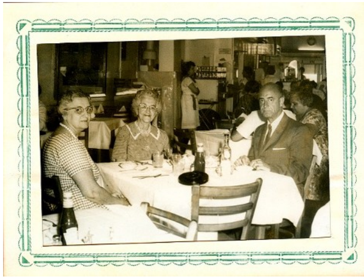
Souvenir of a pleasant visit to CAPTAIN STARN'S ATLANTIC CITY, N. J.

It was quite common to take home a photo of your dining experience at Capt. Starn's Restaurant.