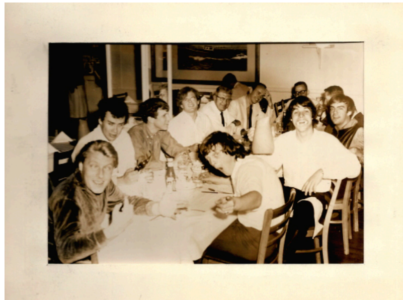
Paul Revere and the Raiders (whose hit song "Indian Nation" is used in this week's video clip) dining at Captain Starn's Restaurant in the 1960s. Maybe they dropped a quarter in the Mold-A-Rama machine and took home a Capt. Starn's SAILBOAT mold?! (By the way, they are still on tour today!)