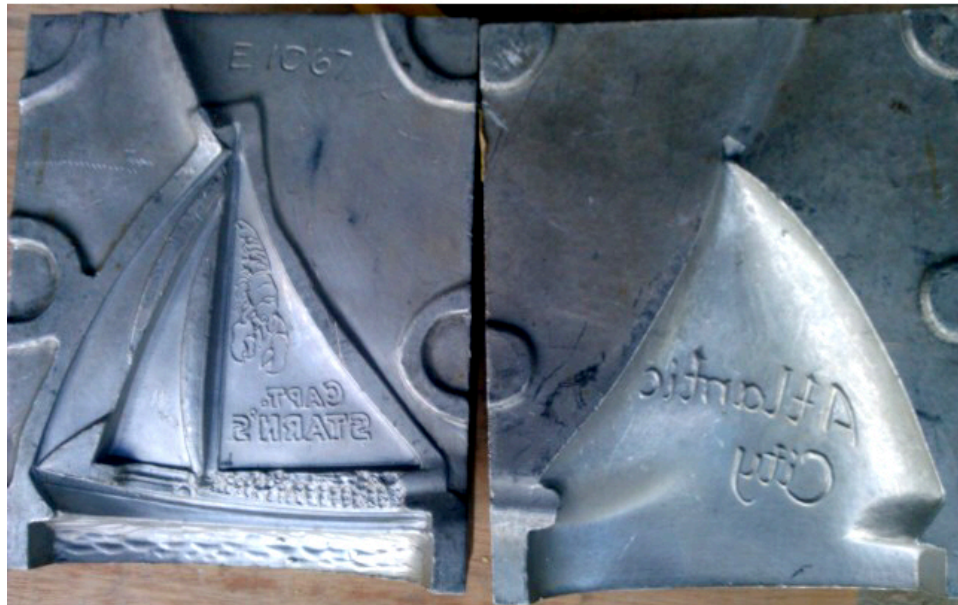
The Capt. STARN'S SAILBOAT moldset was designed and made in 1963.

Disclaimers: The color and/or exact condition of the MOLD you get in the CLUB-A-RAMA may or may not be as shown. Not for children under 3.