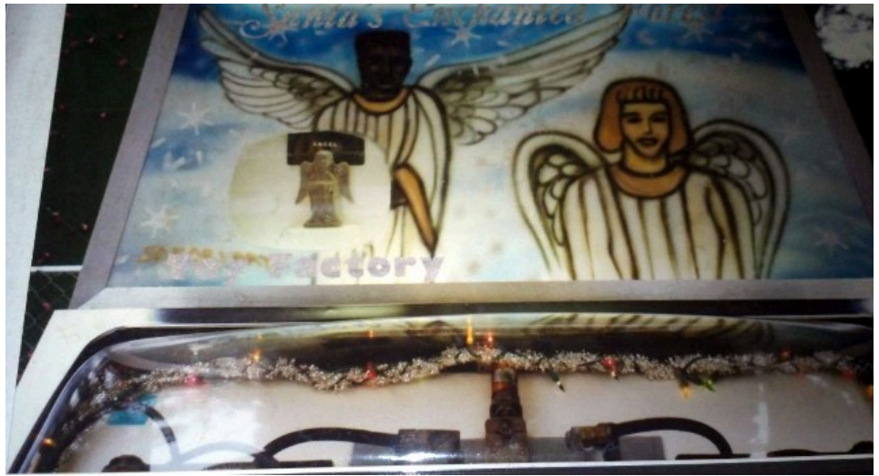
This is a view of the airbrushed plexi for the ANGEL at SANTA'S ENCHANTED FOREST in Miami, FL. The face of the airbrushed angel with its wings spread apparently is a self-portrait of the airbrush artist himself!