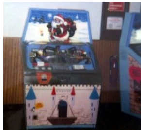
The SANTA moldset at The Children's Wonderland