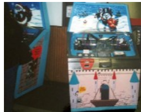
The SNOWMAN moldset at The Children's Wonderland