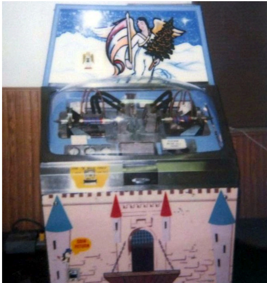
The standing ANGEL is seen every year at Christmastime at a few locations (though there are a relatively limited number of the standing ANGEL moldsets in existence), perhaps most famously remembered for being at the CHILDREN's WONDERLAND in Toledo, OH for 43 of the past 46 years.