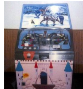
The REINDEER moldset at The Children's Wonderland

These machines, unfortunately, are no longer at the Children's Wonderland. After 45 years, Children's Wonderland closed. In search of a new venue to carry on, the Children's Wonderland display made a 10-day appearance in Downtown Toledo that first year after closing, then sold for $1 to a new venue at Tam-O-Shanter where it has been for the past two seasons, last year for a 10-day run, and this year for a 20-day run. Sadly though, the new owners of the Children's Wonderland have not seen fit to include accommodations for the Mold-A-Rama machines that thrilled kids (and parents) for nearly half a century (and for nearly all of its existence.) After a couple years of hoping, it was not to be, and this past fall the four machines formerly at Children's Wonderland were brought home. I think a campaign to bring Mold-A-Rama back to Children's Wonderland in Ohio might be in order!