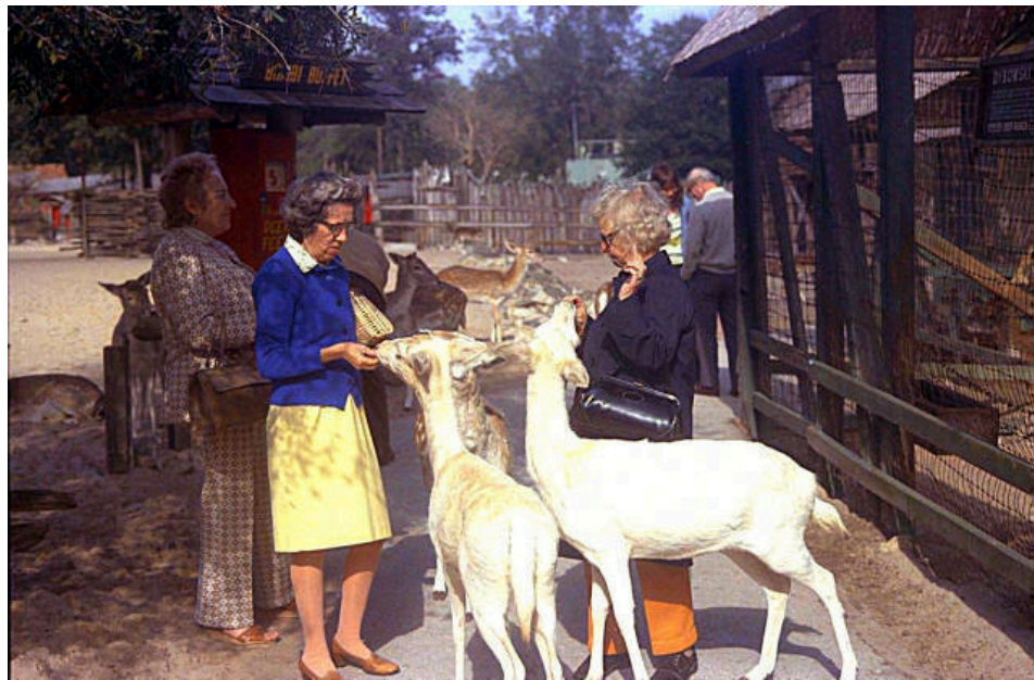
Note the "Bambi Buffet" Deer Feed vending machine in the background for 5c. (This photo from 1971)