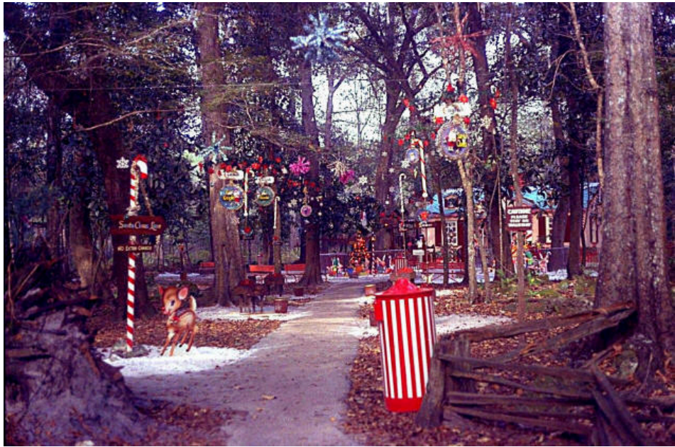
"Santa's South Pole" at TOMMY BARTLETT's DEER RANCH