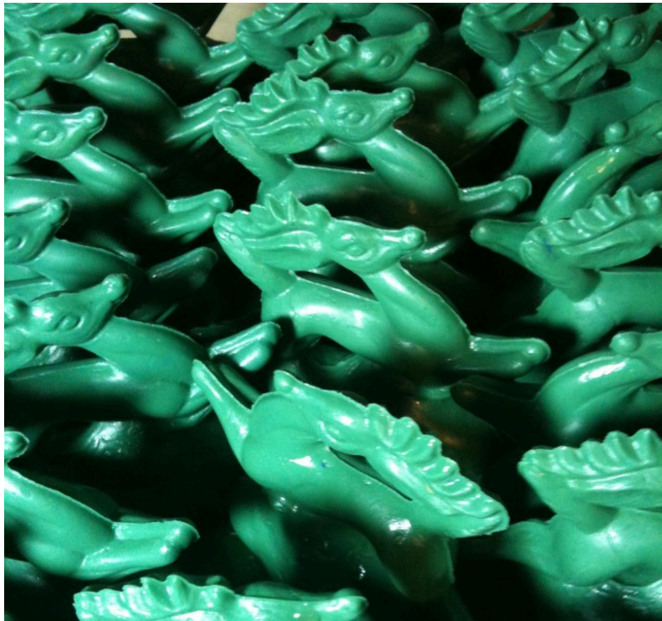
The flying REINDEER was vended at THE CHILDREN'S WONDERLAND from the early 1960s through the 1970s. Also, it was run in the 1990s at the LOWRY PARK ZOO .