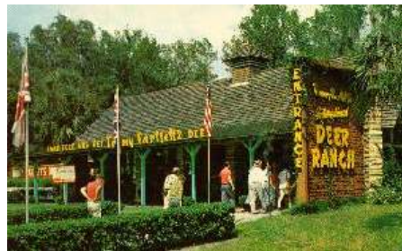
But one of the VERY first locations where the flying REINDEER was run, if not THE first location where it was run, was at the TOMMY BARTLETT INTERNATIONAL DEER RANCH at Silver Springs, Florida. Original figures from that location were inscribed, simply, "DEER RANCH".