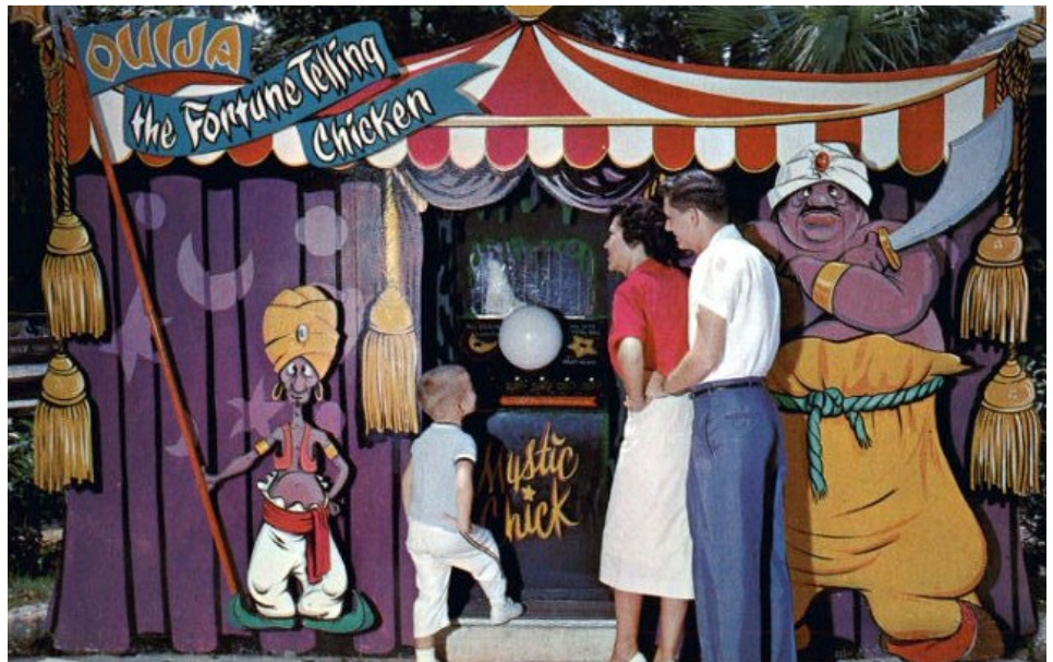
Ouija gives the answers as to what the future holds for the visitors to Tommy Bartlett's Deer Ranch at Florida's Famed Silver Springs.