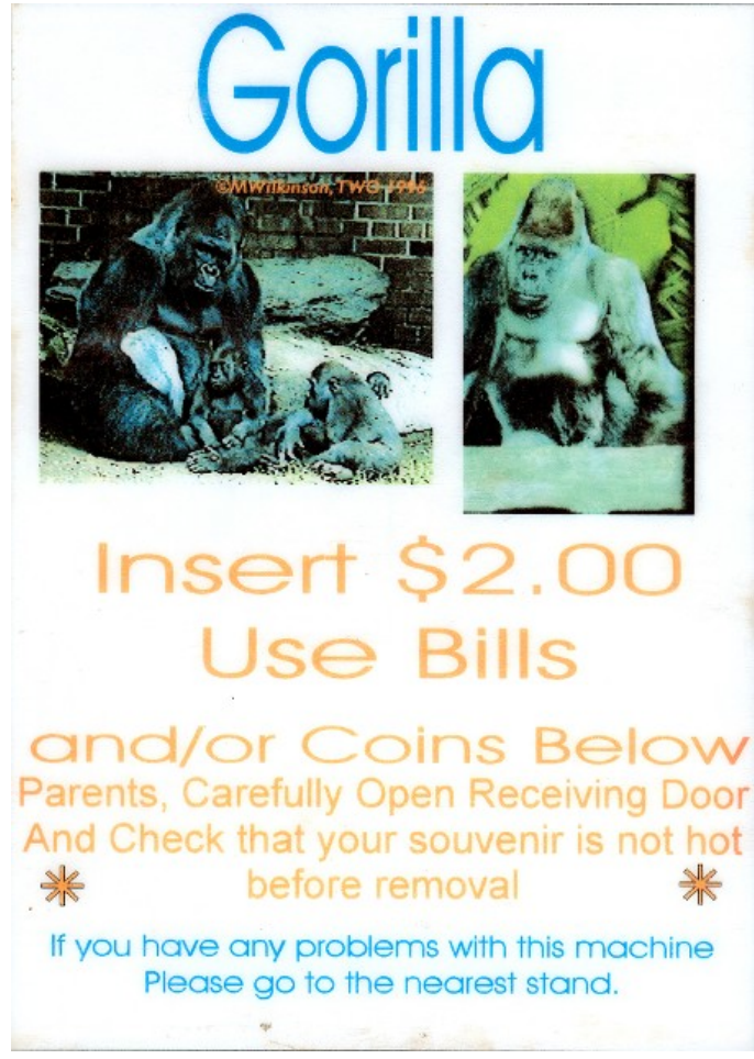
This is the sign that hung on the last machine at the LA ZOO that vended the LARGE GORILLA. Sadly, there are no longer any machines operating in California.