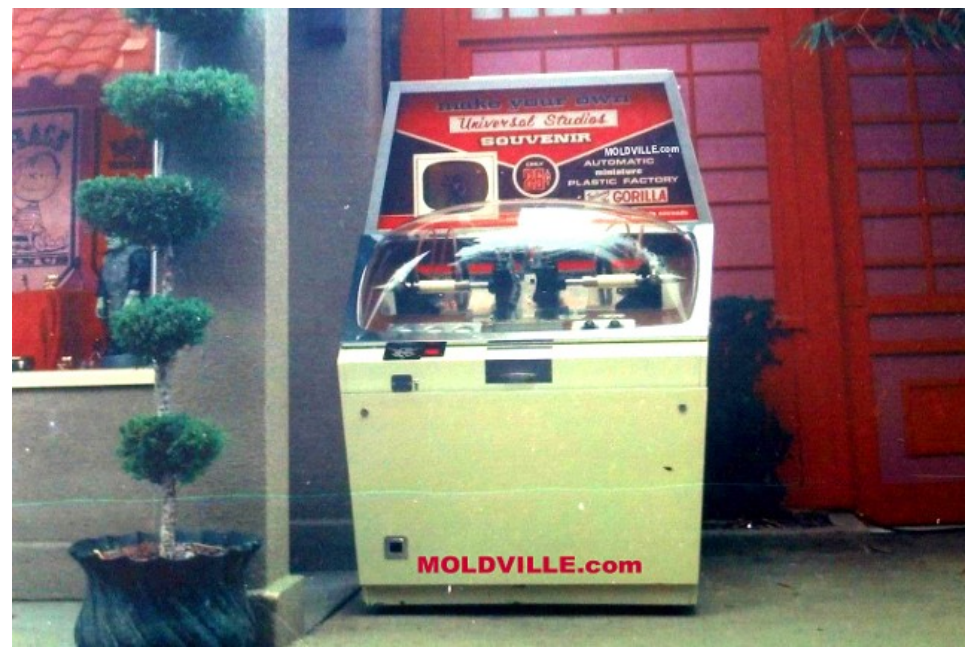
I know how we all look forward to vintage photos (me too!), so here is one from UNIVERSAL STUDIOS, Los Angeles. This machine is vending the LARGE GORILLA, but I thought it would be fun to include in this week's writeup.