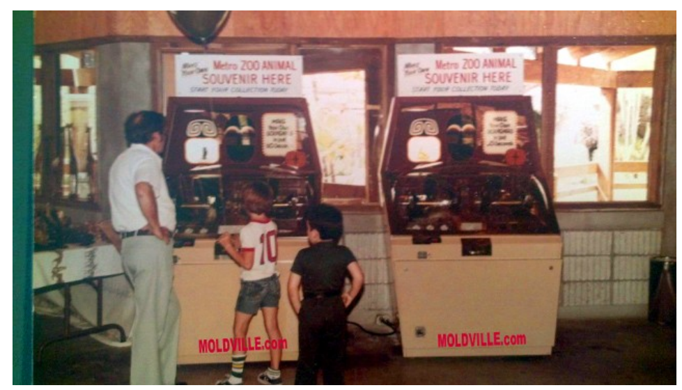
MIAMI METRO ZOO, now known as ZOO MIAMI. The machine on the left is molding the SMALL GORILLA.