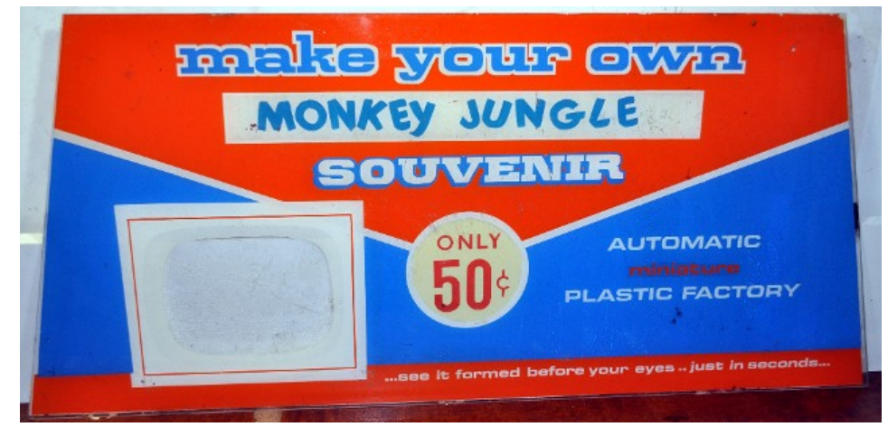
The MOLDVILLE archive includes this actual original plexi backglass from the GORILLA mold machine during the 50c period (the 1970s through the 1980s) at the MONKEY JUNGLE.