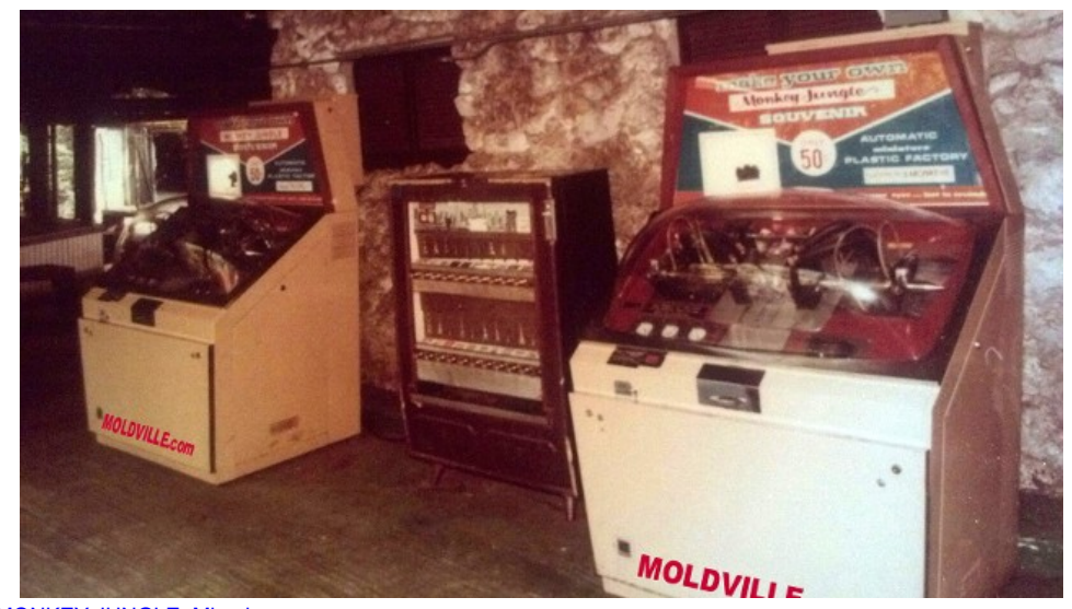
MONKEY JUNGLE, Miami