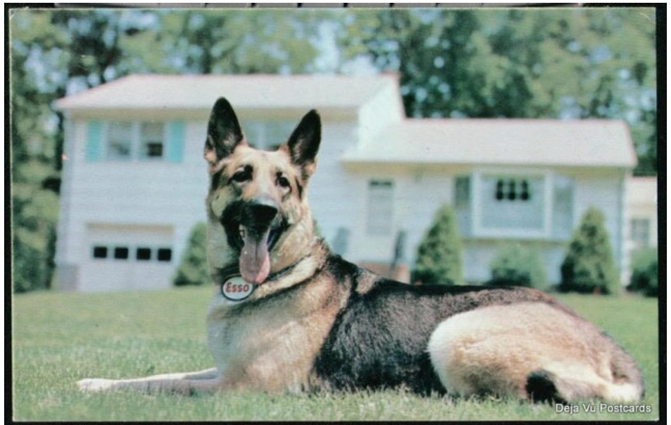
This vintage postcard reads on the back: "Famous Esso Watchdog . . . guardian of your home heating comfort."