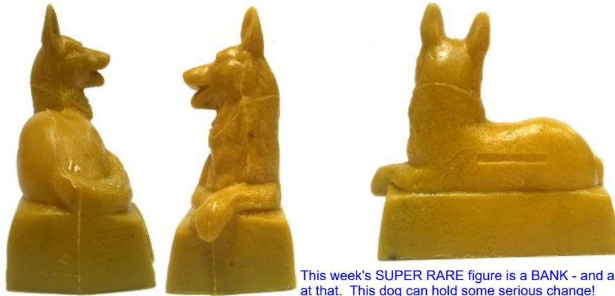
This week's SUPER RARE figure is a BANK - and a large one at that. This dog can hold some serious change!