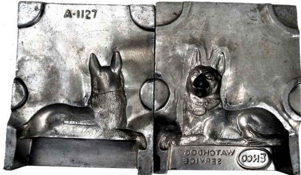
The ENCO WATCHDOG service bank was numbered immediately after Lyndon Johnson became president (his presidential bust is numbered just two before the ENCO WATCHDOG), dating it rather definitively to December 1963.

Disclaimers: The color and/or exact condition of the MOLD you get in the CLUB-A-RAMA may or may not be as shown. Not for children under 3.