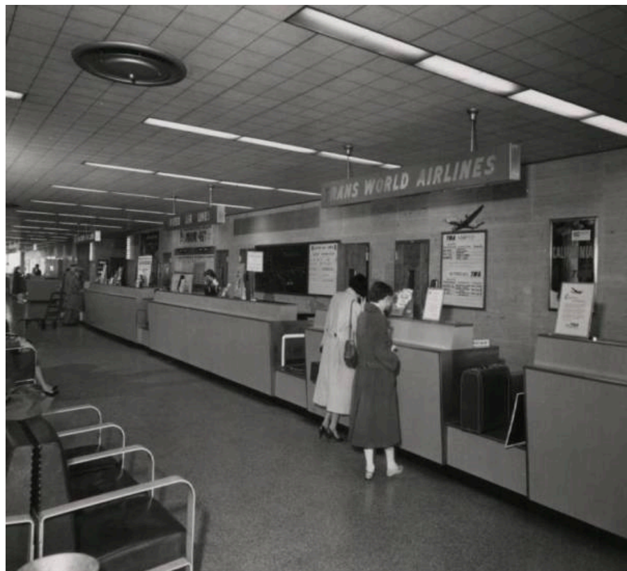
By 1963, Friendship International Airport boasted of a 9,450' runway, which could handle any jet at the time. For years the airport was owned and operated by the City of Baltimore, with 145 municipal employees and 1,400 employees. In 1963 there were 150 daily flights, 11 airlines and 19 gates available.