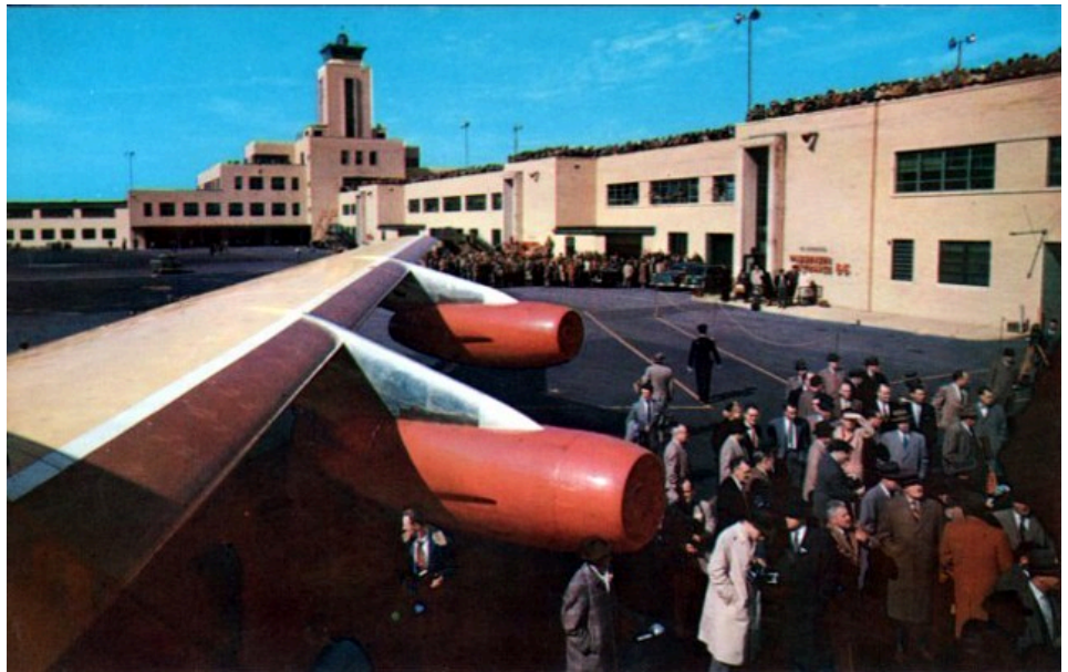
This postcard of Friendship International Airport is from 1966. Remember the days when you waited outside your plane? Me either!