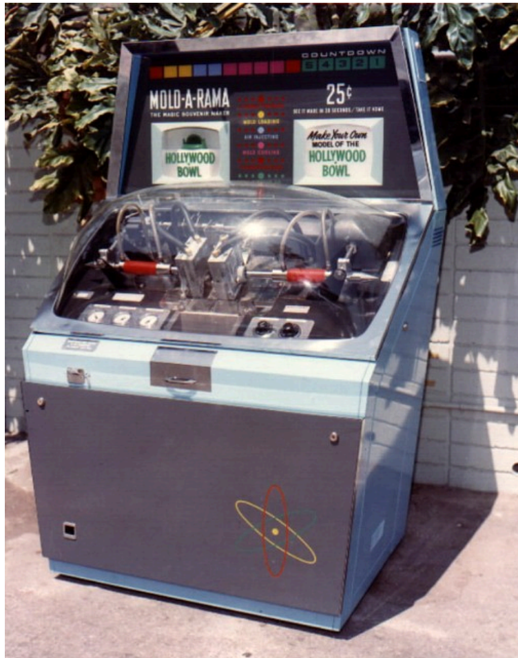
ON LOCATION AT THE HOLLYWOOD BOWL c1962

The HOLLYWOOD BOWL moldset on the machine in this vintage photo is THE VERY SAME MOLDSET from which your souvenir was just made - it is the only HOLLYWOOD BOWL moldset ever made!