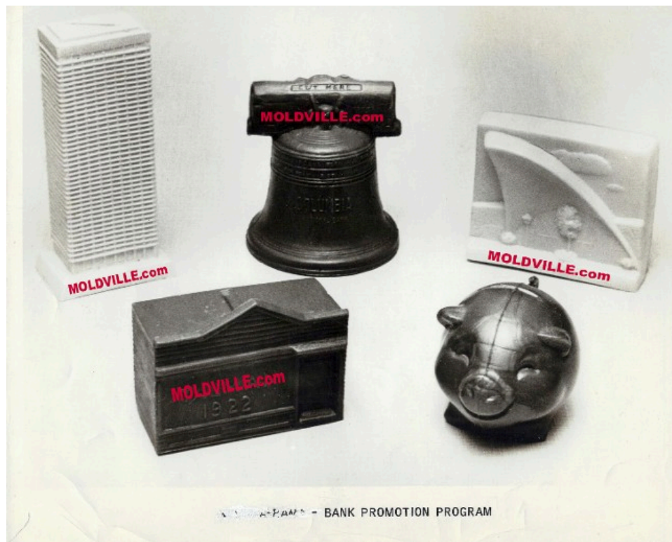
The WILLOW GROVE LANES bank (upper right) was included in Mold-A-Rama's bank promotion program, as seen in the above vintage promotional brochure that Mold-A-Rama put out in the 1960s entitled " MOLD-A-RAMA - BANK PROMOTION PROGRAM. "