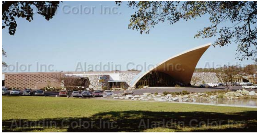
Willow Grove Lanes was a massive bowling alley built in 1961 at the century-old Willow Grove Amusement Park in Pennsylvania, about 15 miles north of Philadelphia. Built by architects Powers, Daly and DeRosa, masters of the 'California-style' bowling center), it was an 800' long "V"-shaped building that took 15 months to build. The main entrance was highlighted by a solid parabola that swung skyward 116 feet and hovered over a multicolored water fountain situated in a miniature lake. When you entered the building your eye was drawn to a rotating turntable display of bowling paraphernalia. (Credit to the book "Diners, Bowling Alleys and Trailer Parks" by Andrew Hurley (2001), and to the Tikiroom.)