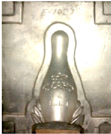
The BOWLING PIN & SCORECARD moldset was made at the same time as THE CHAMP BOWLING PIN moldset (left) and the IN MEMORY OF A ONCE FINE BOWLER moldset (right). All three of these sequentially-numbered bowling moldsets were made in late 1962.