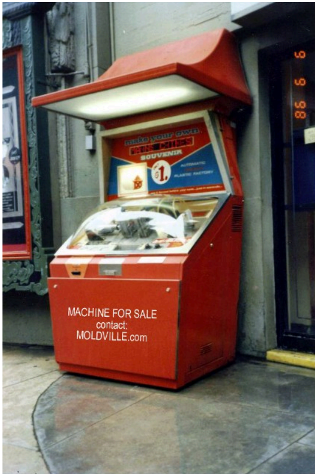
The PAGODA mold was STILL on location at MANN'S CHINESE THEATRE in this vintage $1 era photo from 1986. Check out the rotating LED display behind the plexi backglass - Sweet!