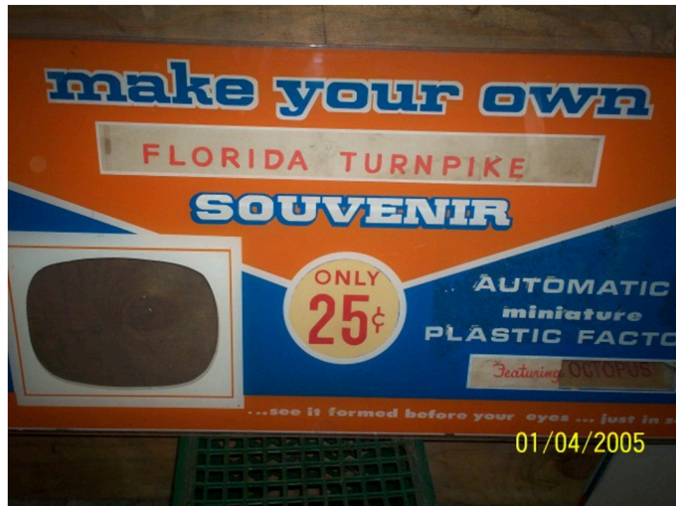
This FLORIDA TURNPIKE 25c original plexi backglass is one of the many now preserved in the MOLDVILLE archives.