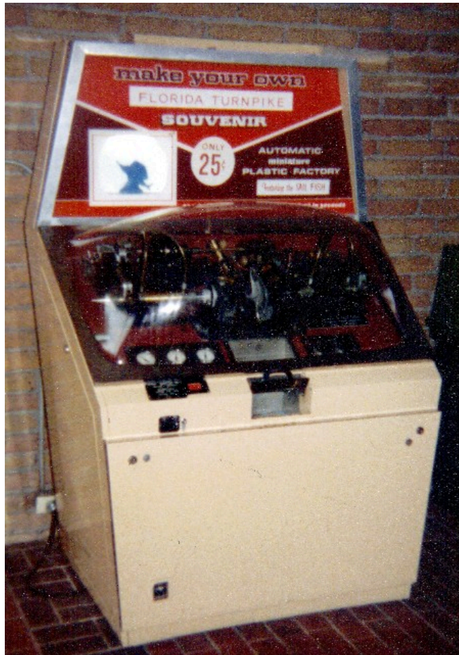
A SAILFISH machine somewhere on the FLORIDA TURNPIKE circa 1970s (note the 25c pricing).