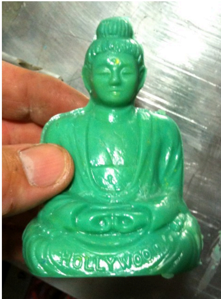
This isn't the color that the BUDDHA was run in for the Club, but it nicely shows some of the detail of the BUDDHA - particularly the engraving of HOLLYWOOD .