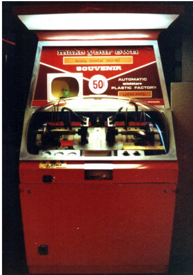
In this post-1973 photo taken during the MANN'S CHINESE THEATRE era (as well as the 50c era), the BUDDHA is called the "LUCKY HOTEL" in the lower righthand corner of the plexi backglass.