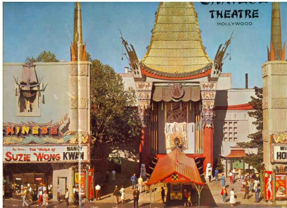
When looking at the Chinese Theatre from the front (from Hollywood Blvd.), the Mold-A-Rama machines (there were two) were located in the courtyard in front of the theater: one around to the left (behind the gift shop) and the other around to the right.