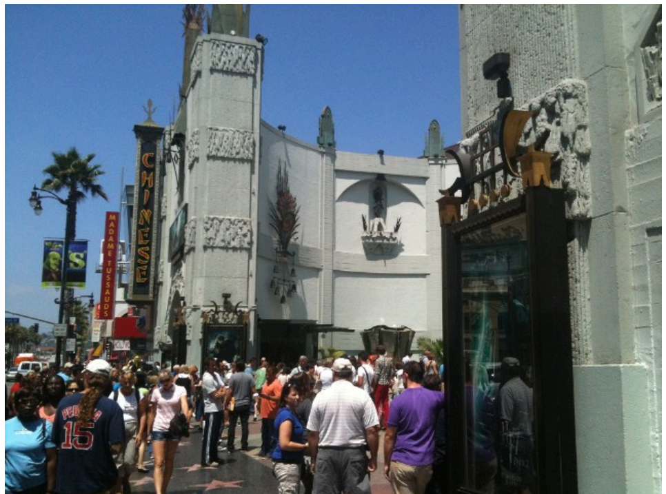
The Courtyard of Grauman's Chinese Theatre is the open area to the right. To the right of the Chinese Theatre is the Kodak Theater, and to the left is Madame Tussauds Wax Museum. When I visited Grauman's last summer I got distracted by a wax figure out front of MADAME TUSSAUDS - it looked SO real!