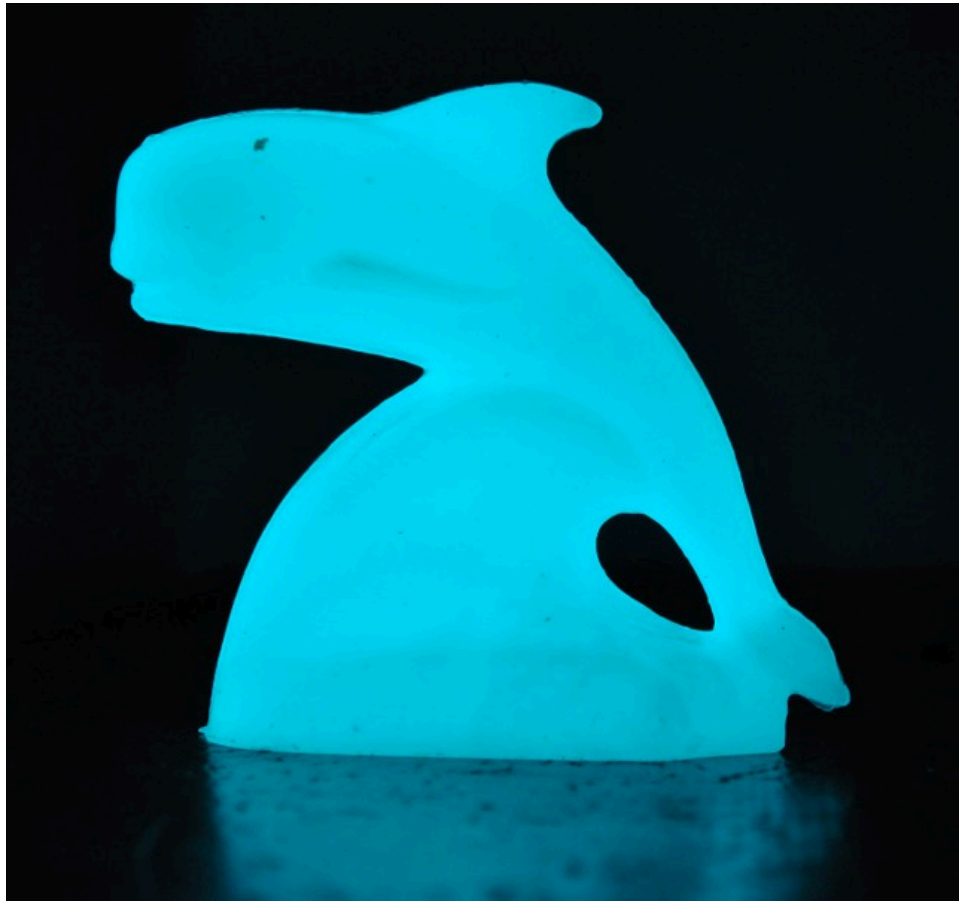
I played with the MOBY DICK HUNT Pilot Whale in Glow-In-The-Dark wax. Pretty cool!