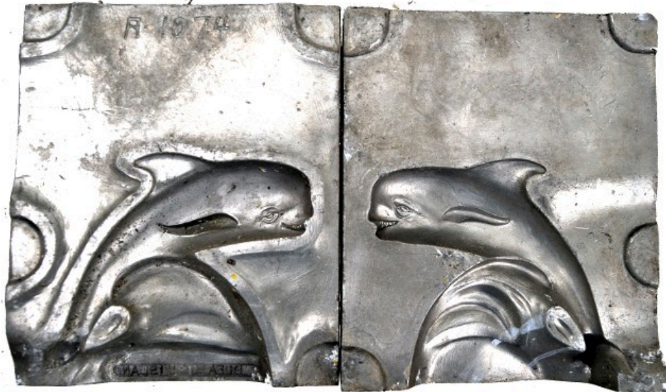
The MOBY DICK HUNT Pilot Whale, engraved "PLEASURE ISLAND" dates to 1963.

Adding to the evidence that the Pilot Whale moldset was first used at Pleasure Island in Wakefield, Massachusetts is the fact that we found a SECOND original Pilot Whale moldset with the same engraving to "PLEASURE ISLAND".