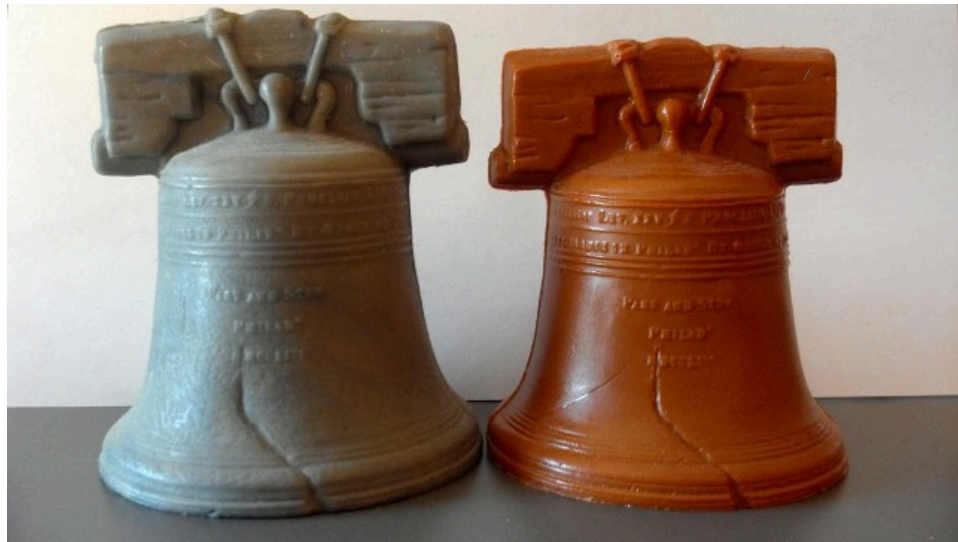
This is a vintage large LIBERTY BELL on the left next to a reissued small LIBERTY BELL on the right. The large LIBERTY BELL , at 4" high, is only 1/4" taller than the small LIBERTY BELL . Club-A-Rama members will receive a reissued small LIBERTY BELL .