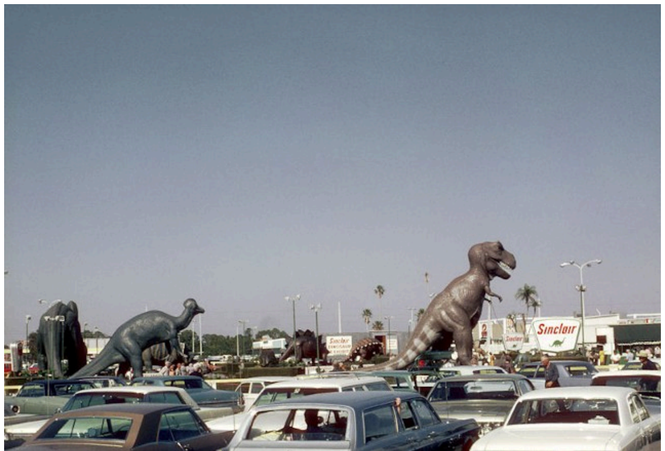
The Sinclair dinosaurs were still touring in 1968, shown here in Florida.