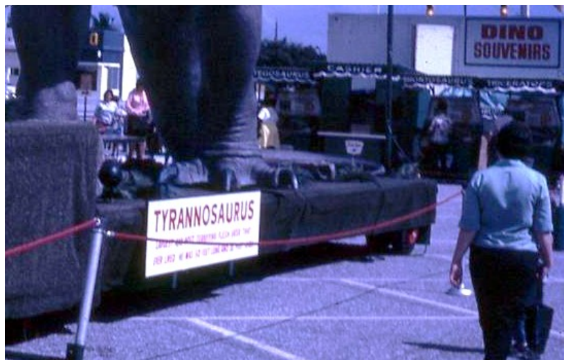
These photos of the Sinclair tour were taken in 1967. The MOLD-A-RAMA machines were stationed at the foot of the trailer line, under the "DINO SOUVENIRS" sign. See them? You can just make out the CASHIER in the middle, the STEGOSAURUS machine to the left of the cashier, and the BRONTOSAURUS and TRICERATOPS machines to the right.