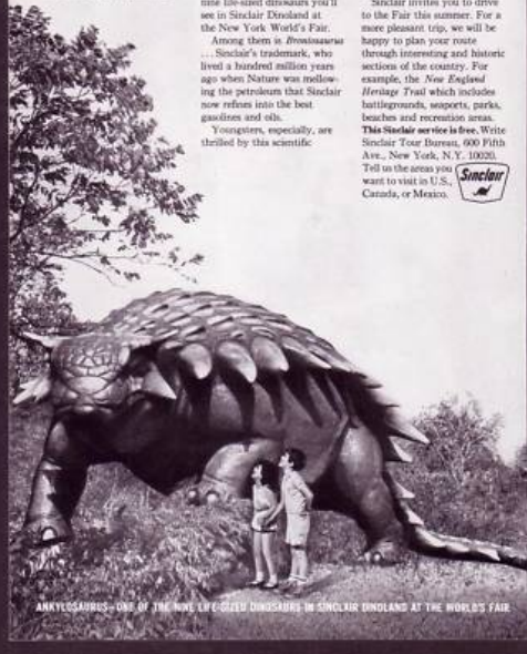
ANKYLOSARUS—ONE OF THE NINE LIFE-SIZED DINOSAURS IN SINCLAIR DINOLAND AT THE WORLD'S FAIR.