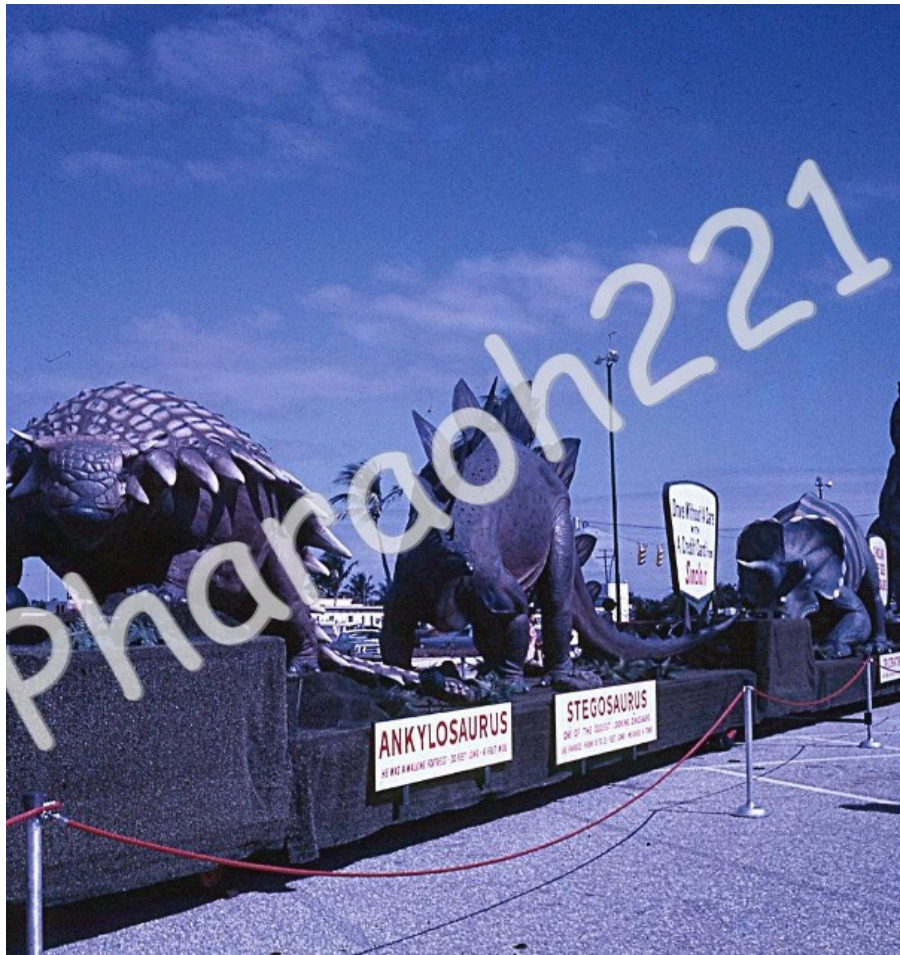
After the NYWF ended, the dinosaur models carried the Sinclair flag and toured the country on specially constructed flatbed trailers from 1966 until at least 1968.