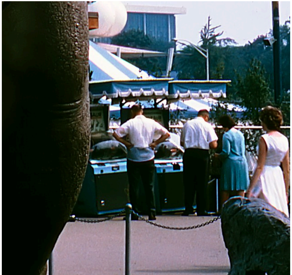
In 1964, the first year of the NYWF, the machines were standard blue body, new-style (Model 688-A) with the gray 'atom logo' front door. (I have a theory that just about ALL of the 'new' style machines were made for use at the NYWF...)