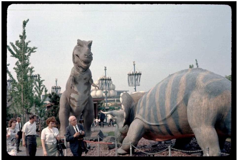
The following year, shown in the image below (and its closeup just below that), the machines were painted GREEN all around, and carried a large square white Sinclair decal on each side and on the front. The backglass plexi was changed as well, as were the umbrellas: