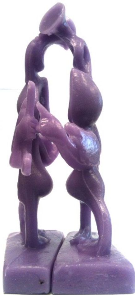
"Dancing With The Stars" (MOLDVILLE.com style!)