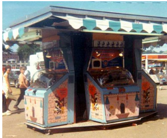
1976 Ohio State Fair. (One of these machines is very likely our very own MOLDVILLE machine back in the day!)