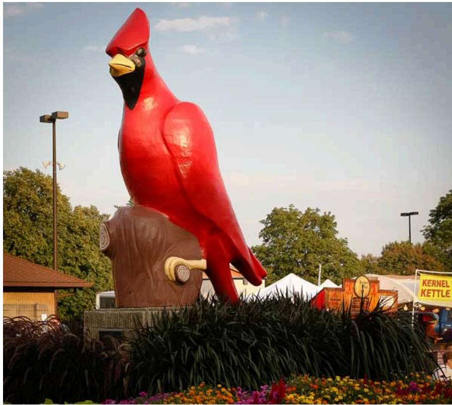
For obvious reasons it is referred to as the "Cardinal Gate"! We are told that the Ohio State Fair still has a vintage Molded souvenir of the CARDINAL on display.