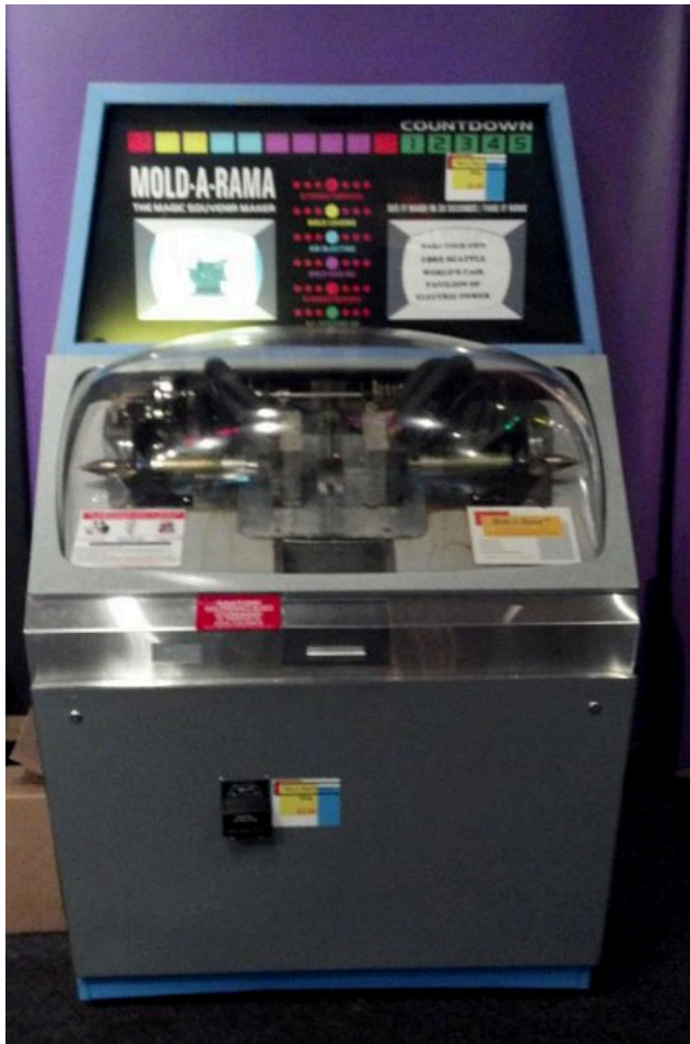
Above and below are photos of the machine currently at the Pacific Science Center running for a limited time the original moldset of the PAVILION OF ELECTRIC POWER . Notably, and not coincidentally, this Mold-A-Rama machine is an early style, Model 688 - the same style machine that the PAVILION OF ELECTRIC POWER moldset was originally vended on at the 1962 Seattle World's Fair!