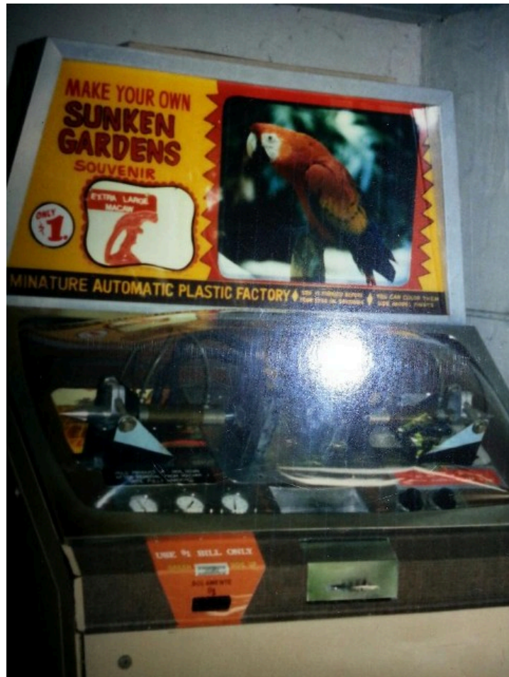
The LARGE MACAW at the Sunken Gardens, Florida, in the mid-1980s.