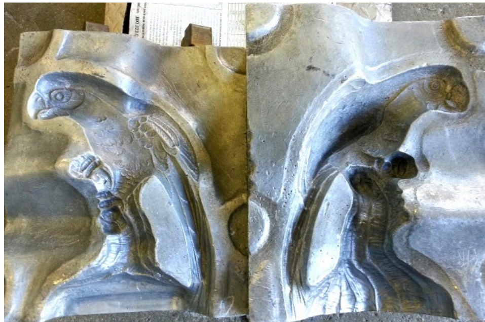
The MACAW moldset is post-ARA (1970s).