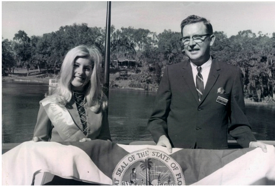
This is a press photo of the reigning Miss Rainbow Springs in 1969, posing with the mayor of Dunnellon, FL.