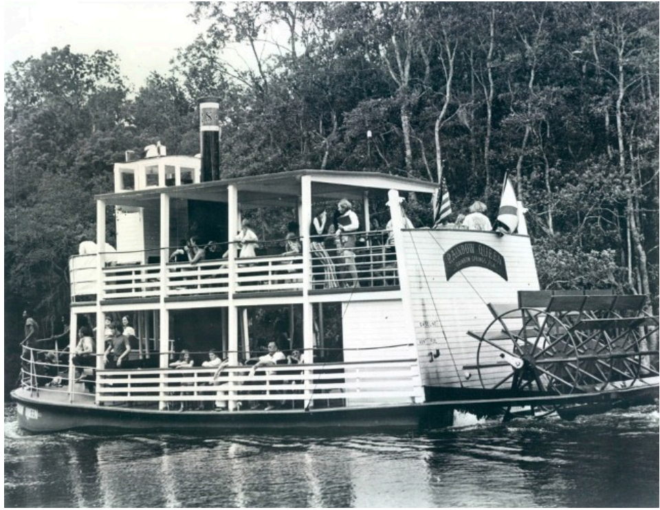
According to the notation on the back of this 1972 press photo, the "Rainbow Queen" was a double-deck riverboat, stirring memories of Florida's early 1800s as she cruised leisurely down the historic Rainbow River. The authentic stern-wheeler was one of the many attractions at Rainbow Springs, located 18 miles west of the Ocala exit of I-75, a main north-south route to Walt Disney World at Orlando. Other highlights at Rainbow Springs included daily western-style rodeos, aerial monorail rides and unique underwater boat trips.